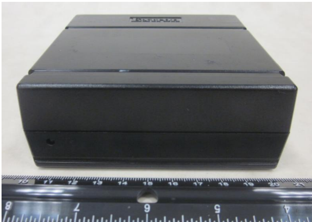
Figure E.5 – Power Supply 2_PoE +48Vdc Front View