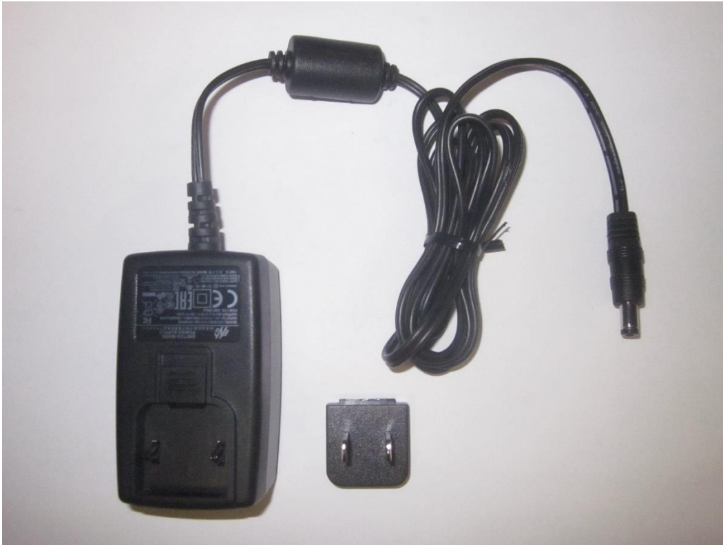
Figure E.1- Power Supply 1_Adapter 5Vdc View 1