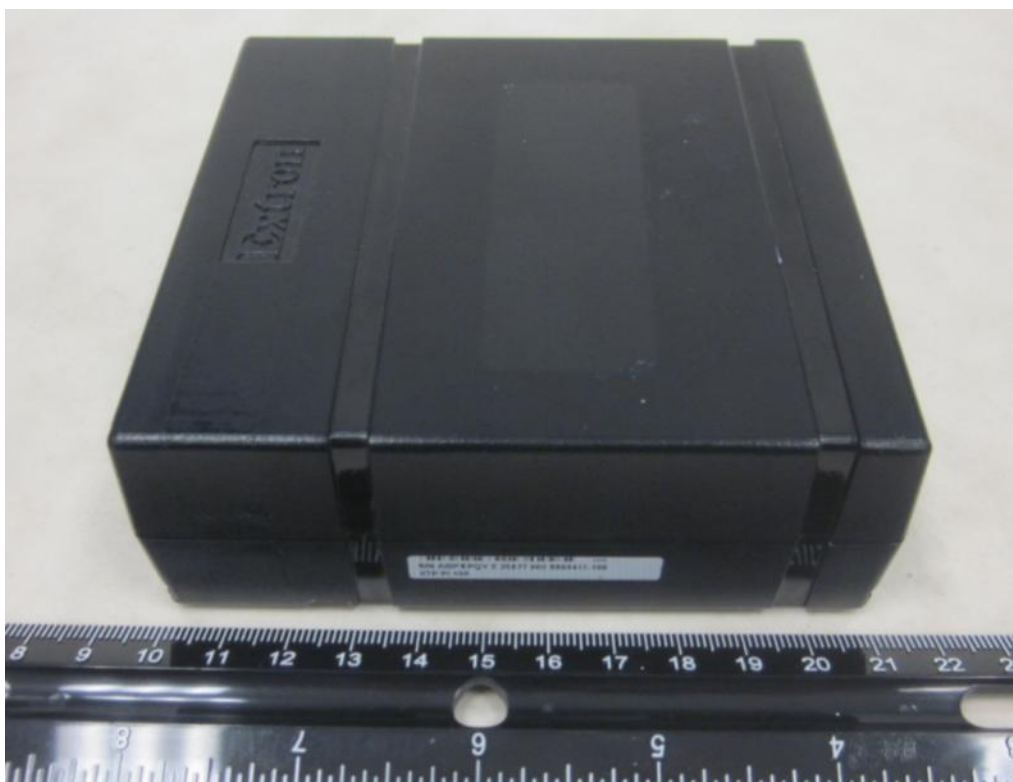
Figure E.6 – Power Supply 2_PoE +48Vdc Side View