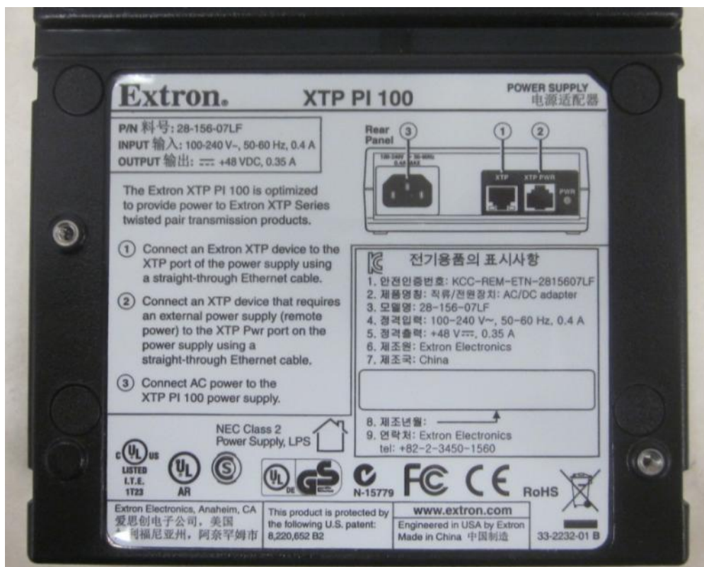
Figure E.8 – Power Supply 2_PoE +48Vdc Bottom (Label) View