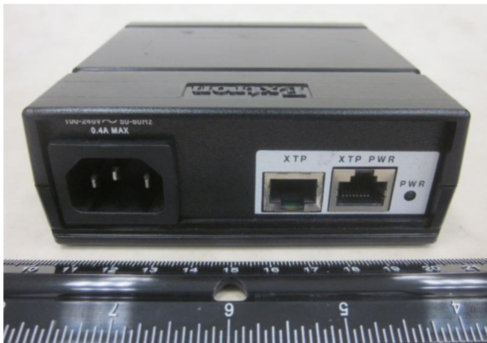
Figure E.7 – Power Supply 2_PoE +48Vdc Side View