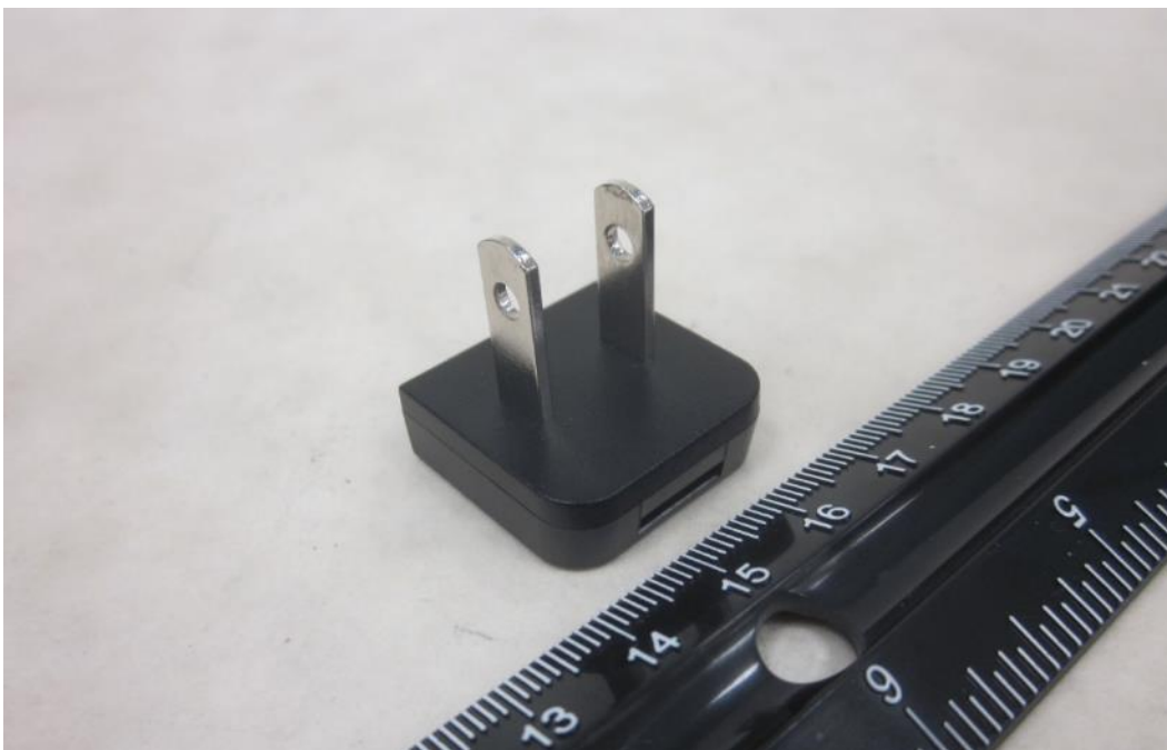
Figure E.2 – Power Supply 1_Adapter 5Vdc View 2