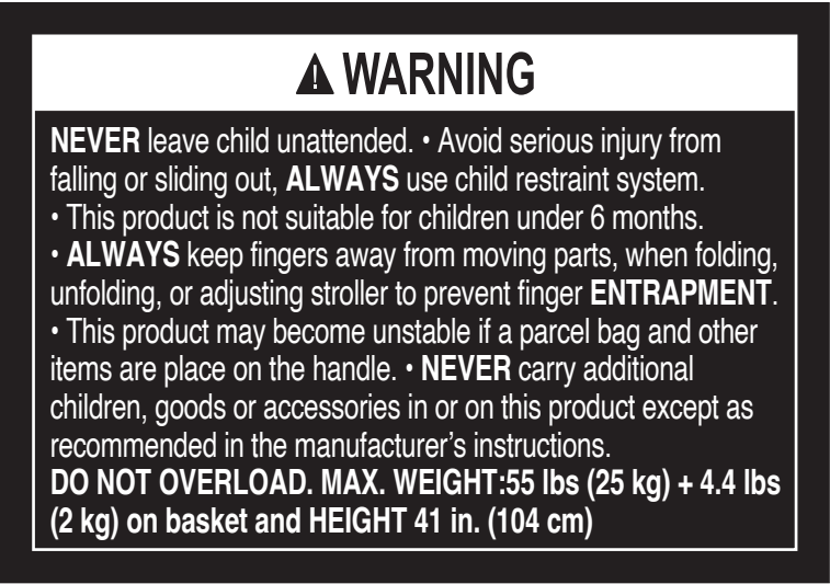
Product Warning Label - size: 7cm x 10cm(2.76” x 3.9”)