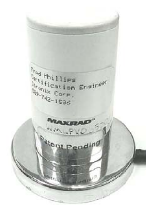
MaxRad 3 dBi Gain Vehicle-Mount Antenna P/N: WMLPVDB800/1900