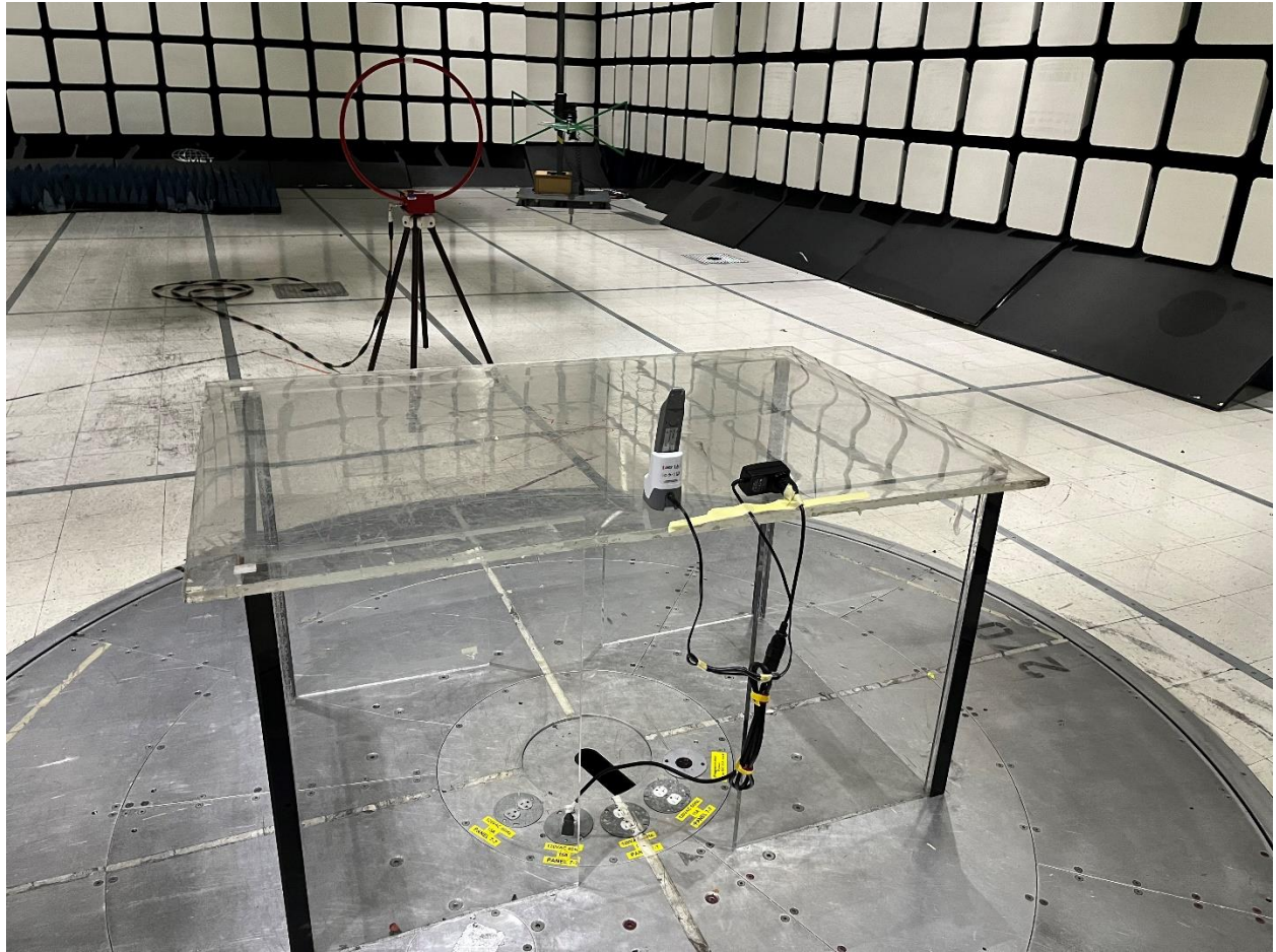
Radiated Emissions Below 30MHz