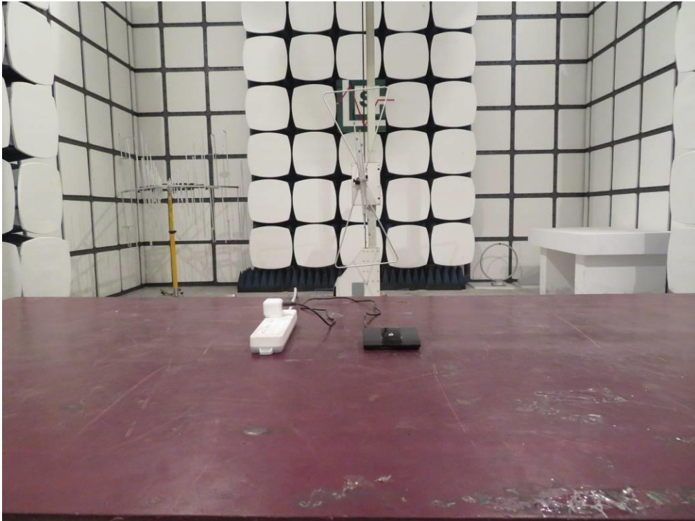
Radiated emission below 1GHz