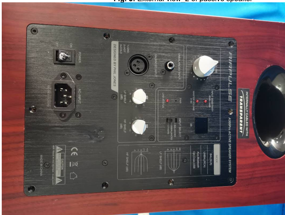
Fig. 6: External view_3 of passive speaker