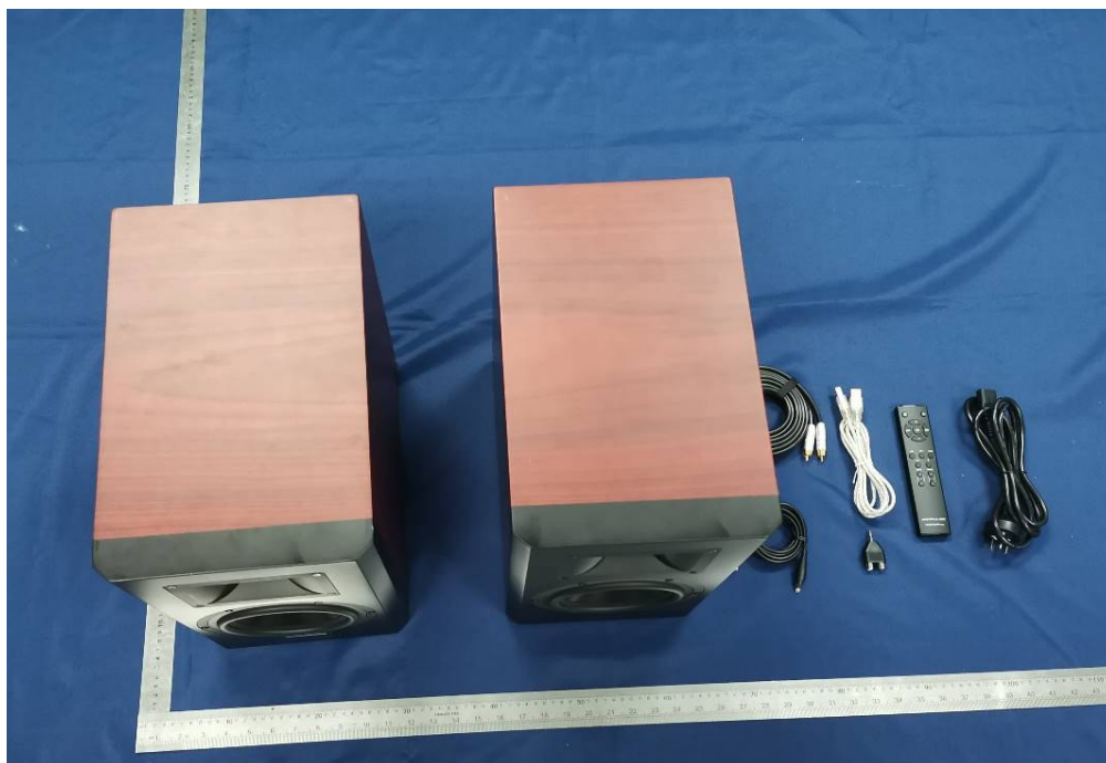
Fig. 1: Overall view