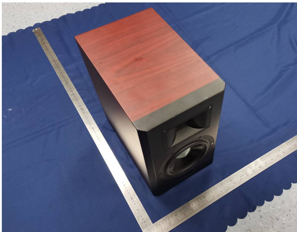
Fig. 2: External view_1 of active speaker