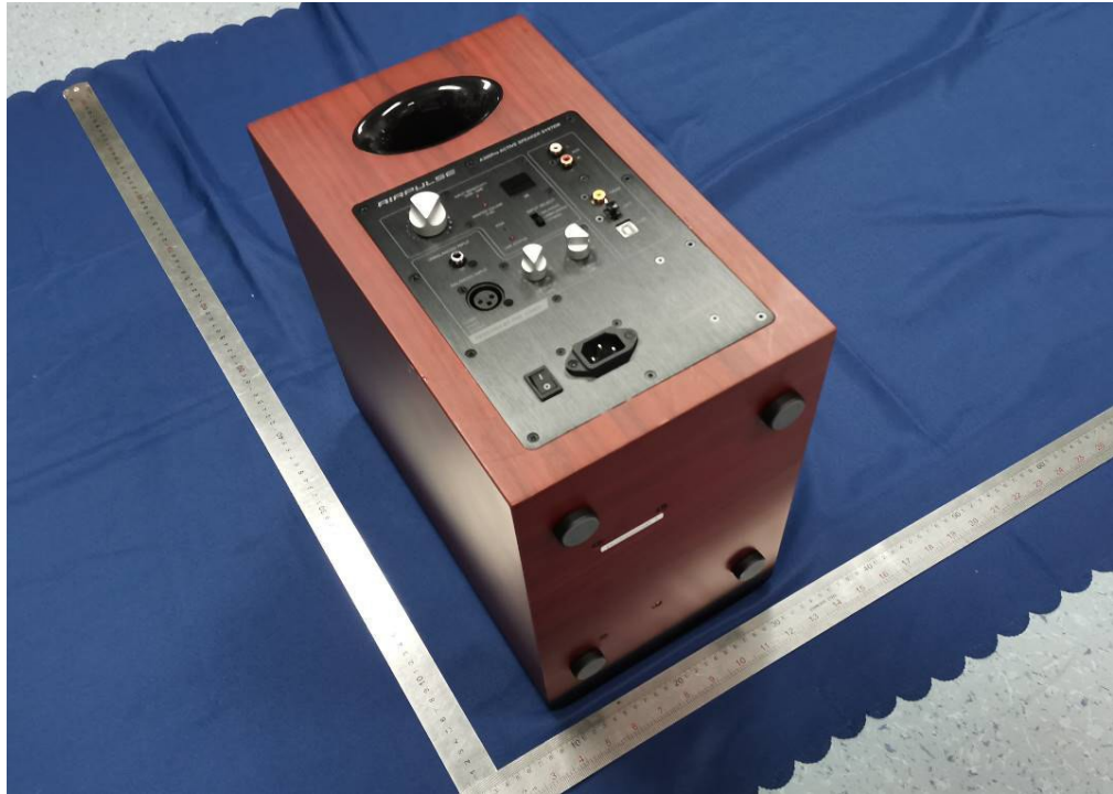
Fig. 3: External view_2 of active speaker