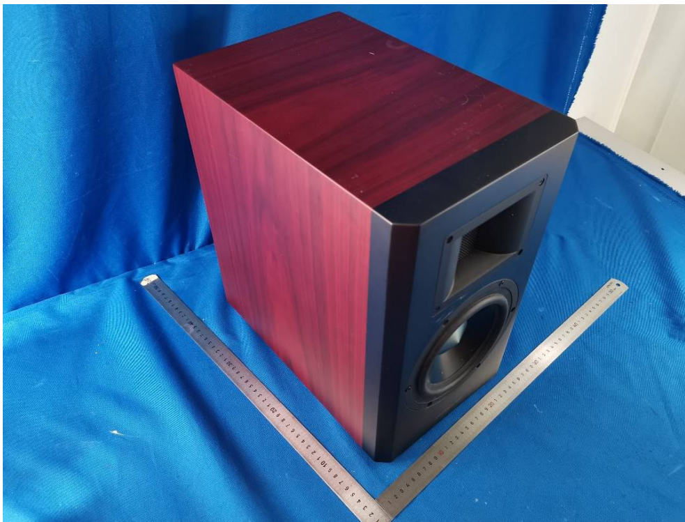
Fig. 4: External view_1 of passive speaker