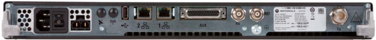
External Back View of Base Radio

EQUIPMENT TYPE: ABZ99FT4096 109AB-99FT4096