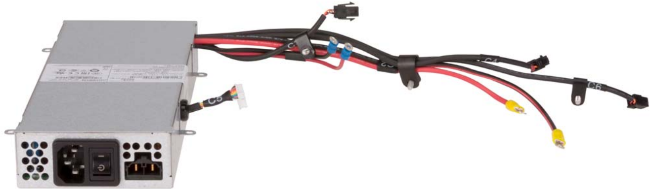
Internal Front View – Power Supply Module

EQUIPMENT TYPE: ABZ99FT4096 109AB-99FT4096