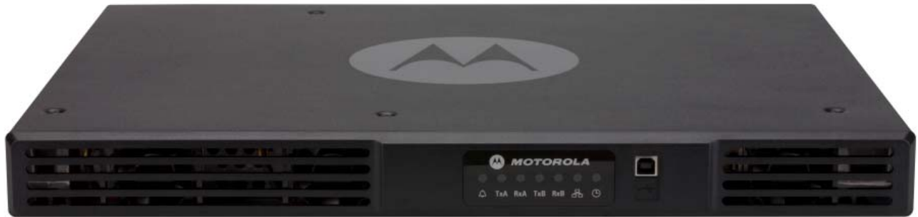
External Front View of Base Radio

EQUIPMENT TYPE: ABZ99FT4096 109AB-99FT4096