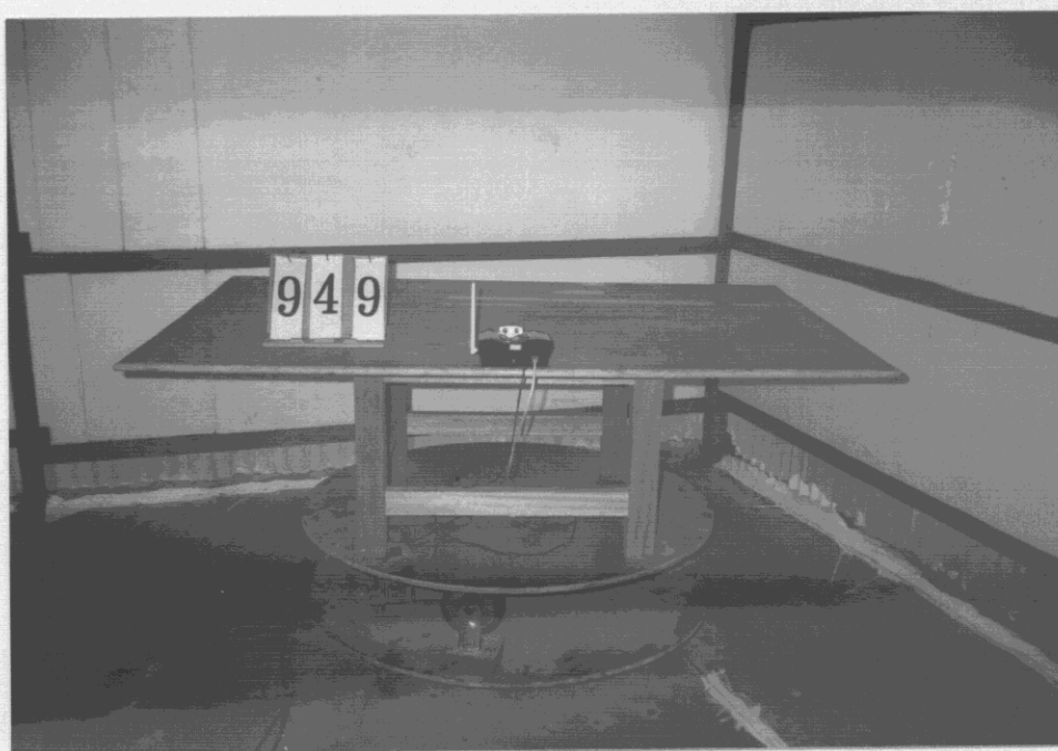
Pic 2 Rear View of the Test Configuration ( BASE )