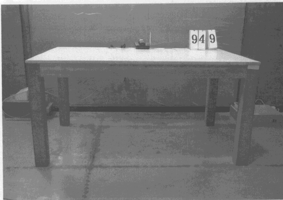
Fig. 1 Conducted Emissions Test Configuration (Idle only)