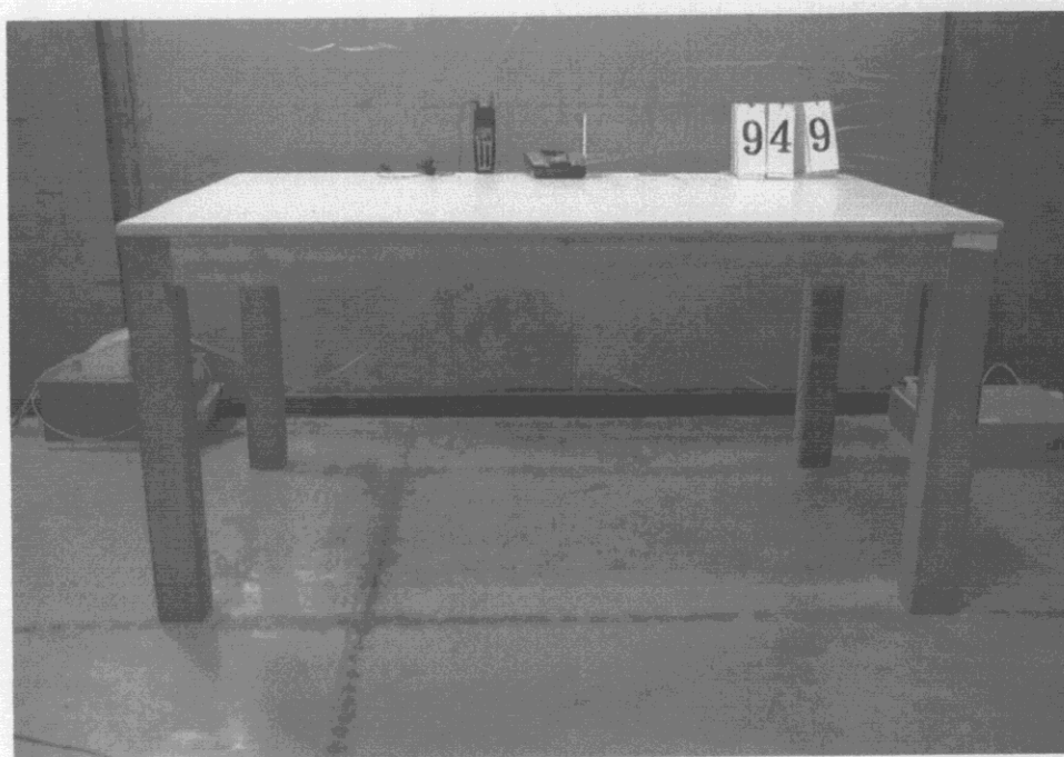
Fig. 2 Conducted Emissions Test Configuration (Operating only)