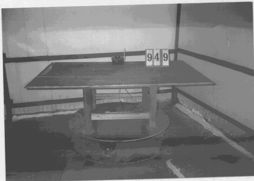
Pic 1 Front View of the Test Configuration ( BASE )