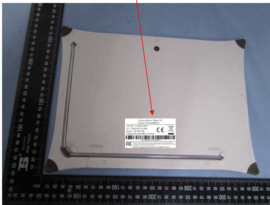
FCC ID Label Location