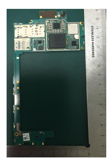
Internal PWB without Shield cases (Rear-side)