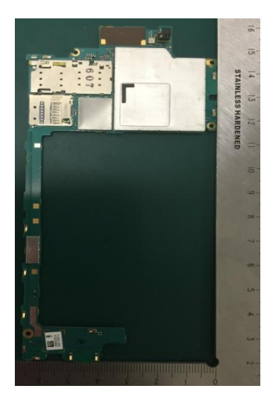
Internal PWB with Shield cases (Rear-side)