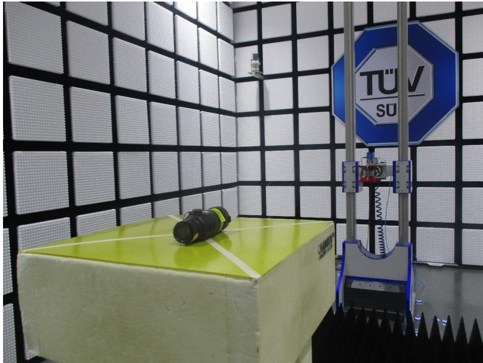
Radiated Spurious emission 1GHz - 18 GHz