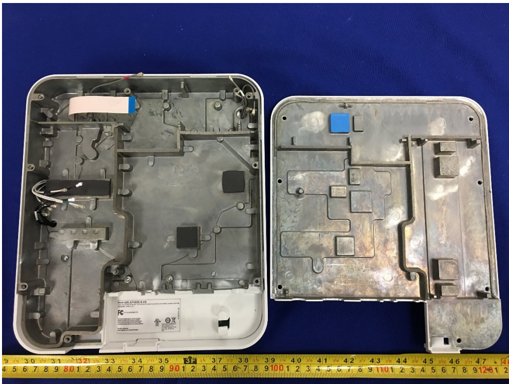
RF Board top side