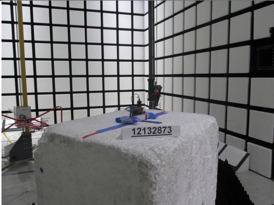
RADIATED BACK PHOTO (ABOVE 1 GHz)