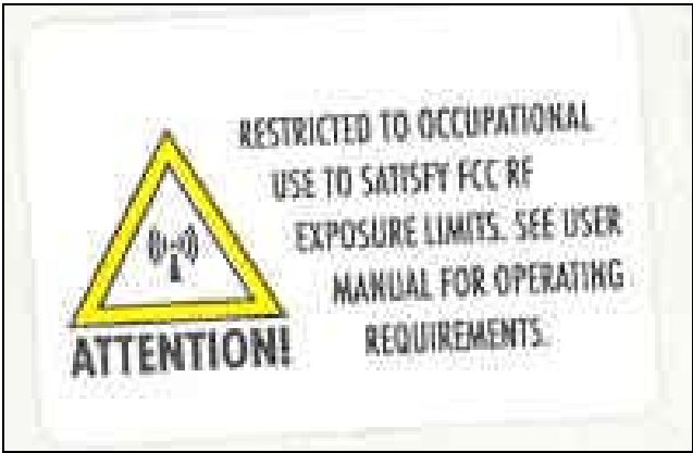
Figure 3-6: Close-up of RF Safety Label