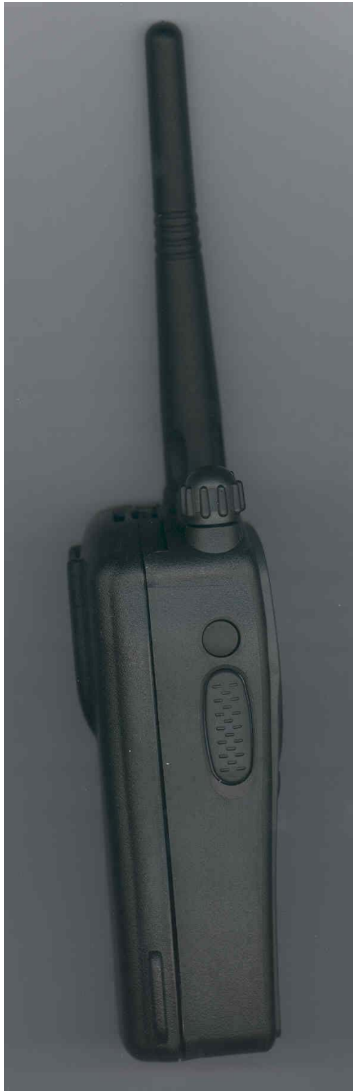
Figure 3-4: Left side view of complete radio.