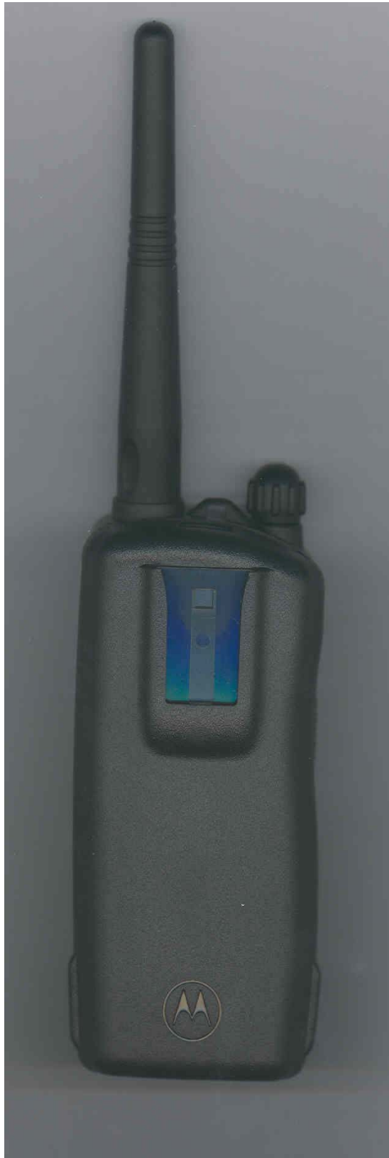
Figure 3-2: Back view of complete radio.