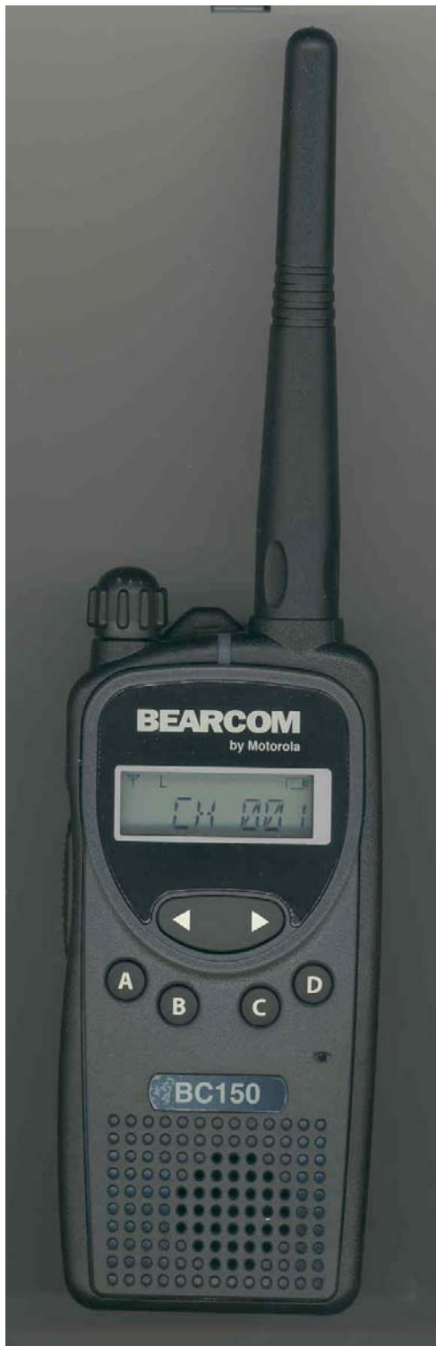
Figure 3-1: Front view of complete radio.