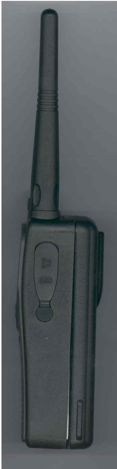
Figure 3-3: Right side view of complete radio.