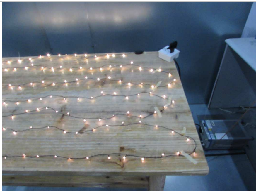
Radiated Emission (30 MHz–1000 MHz)