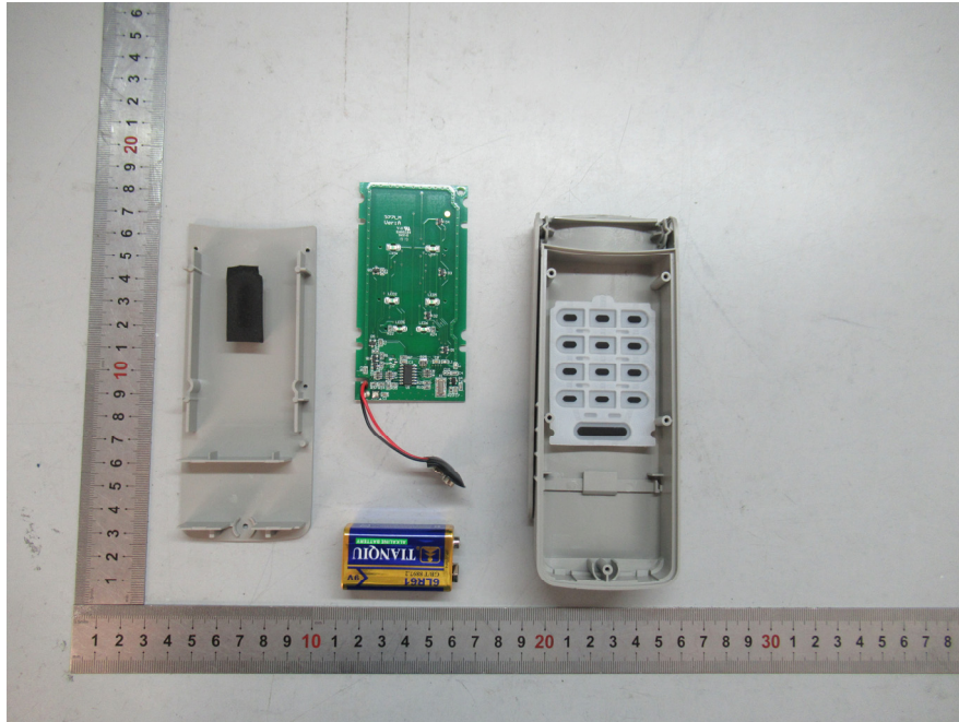
EUT – Battery Top View