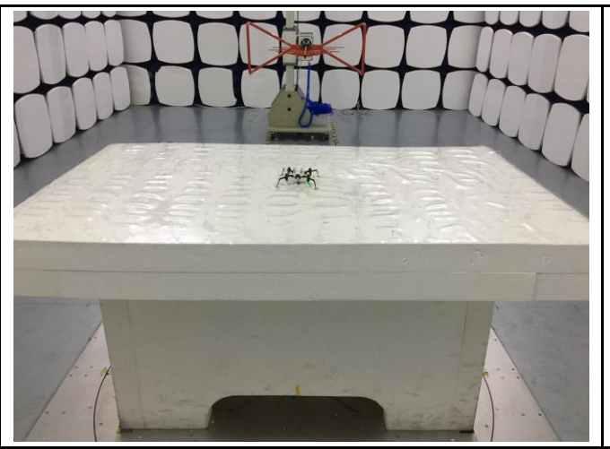
Radiated Spurious Emissions Test Setup Below 1GHz