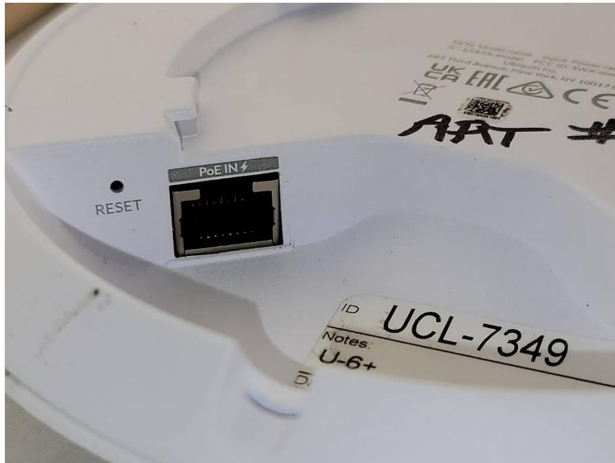
Photograph 7: Connector