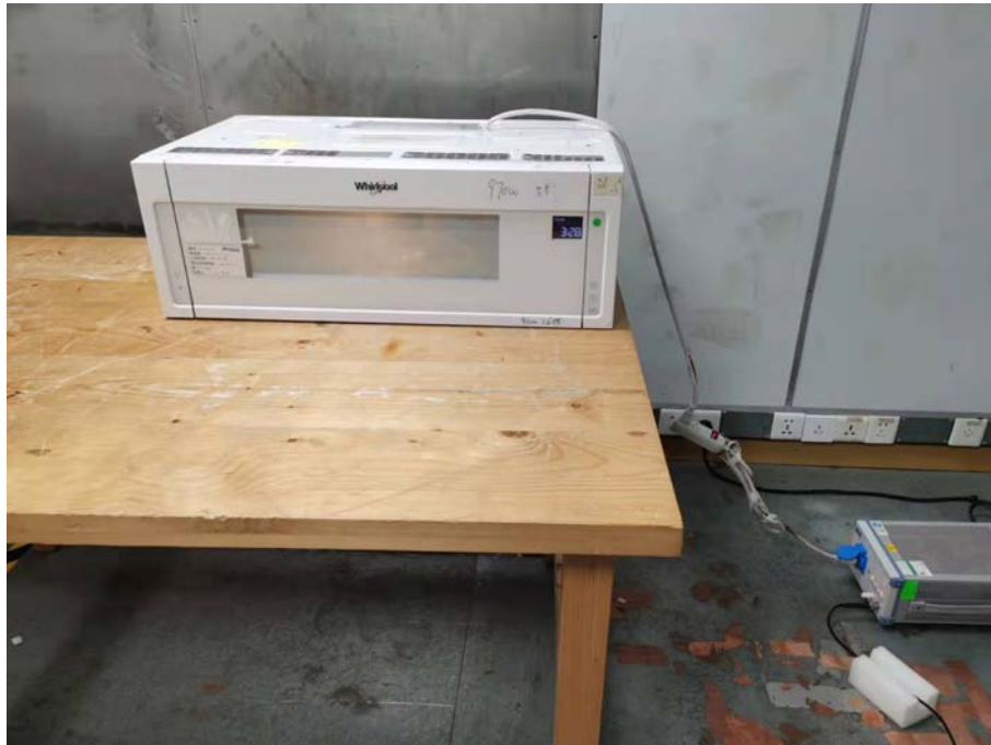
Photo of Power Line Conducted Emission Measurement