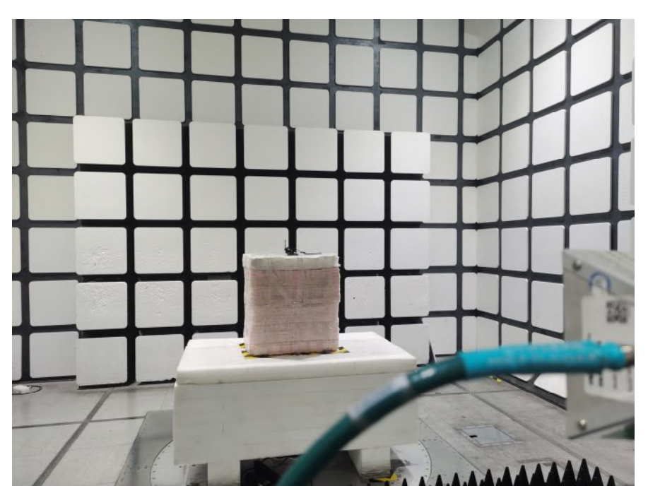
Radiated Emissions View (18-25 GHz) -antenna 3

Radiated Emissions View (1-18 GHz) -antenna 3