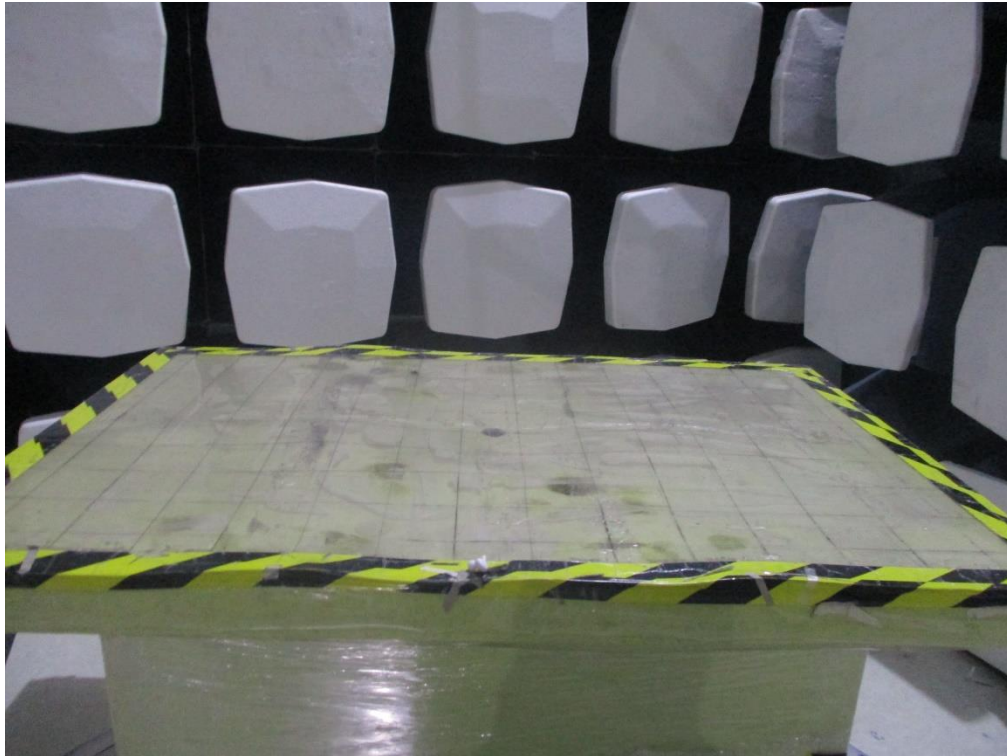
Up to 1G Hz-EUT is on the center of the turn table