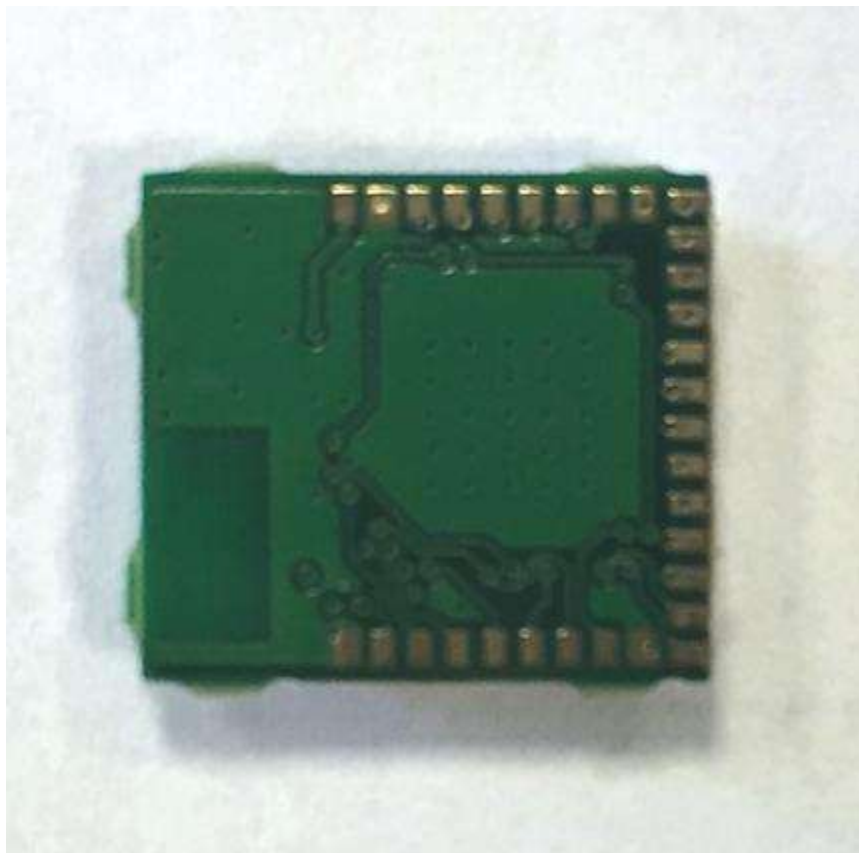
Figure 3. Bottom of BLE Module

FCC Part 15 Certification O7P-RL78 10147A-RL78 17-0165 November 2, 2017 Inventek ISMRL78G1D