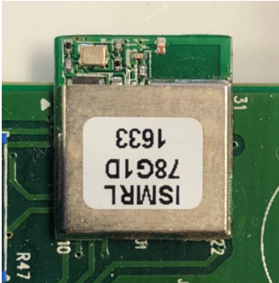
Figure 2. Top of BLE Module

FCC Part 15 Certification O7P-RL78 10147A-RL78 17-0165 November 2, 2017 Inventek ISMRL78G1D