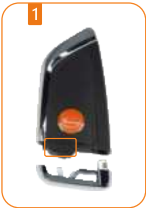
Press the back side button for loose the mechanical key holder

First use or when the battery runs out need to change new battery, following steps: