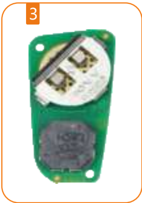
Take the battery out and replace new one

Note: The battery type is 2032 with 3V, ensure the positive and negative of battery is correct.