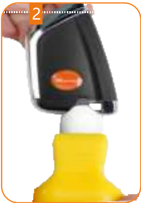
Use the tool into the gap to separate the shell