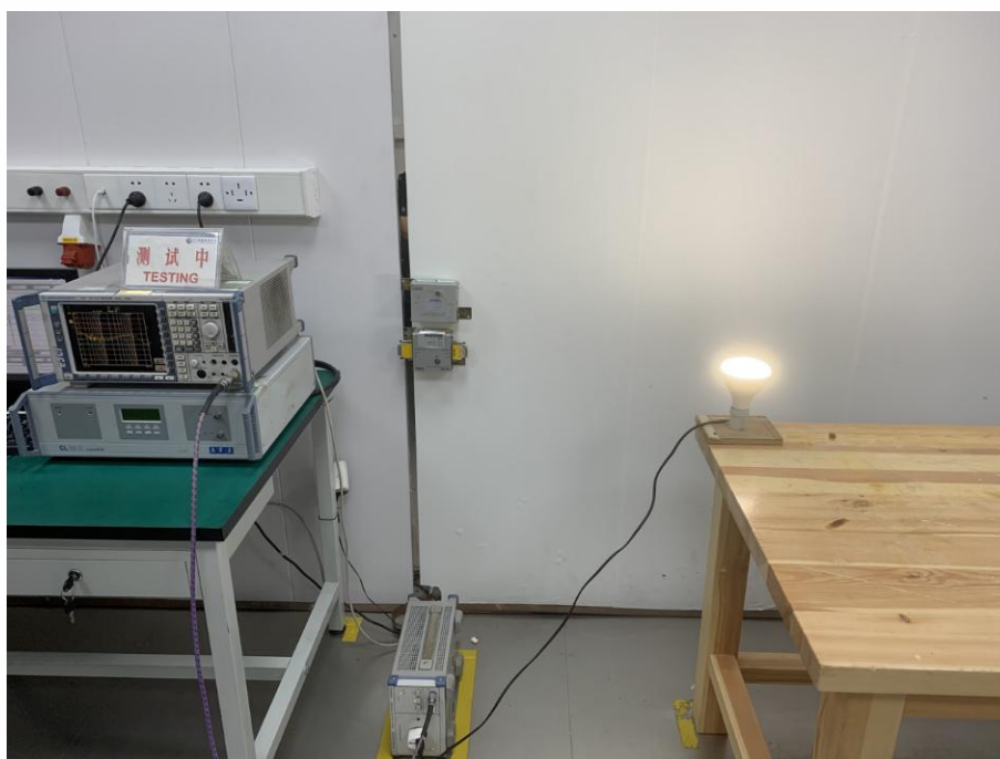
Conducted Emissions Test Setup