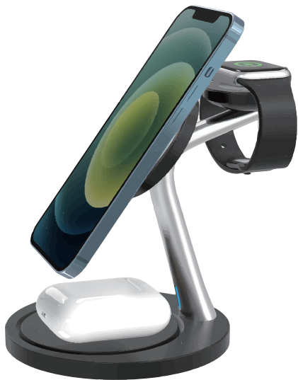
3 in 1 Magnetic Wireless Charger station

This is a 3in1 wireless charging stand built in intelligent and advance chipset. Support charge your mobile phone, smart watch and airpods at the same time. It will bring you excellent and convenient fast wireless charging.