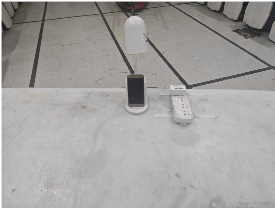
Q51-Back View (Below 1GHz)