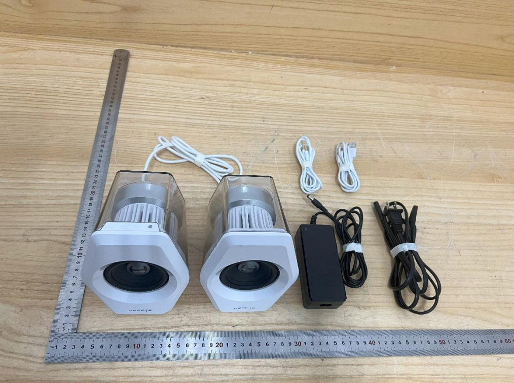
View of EUT-2