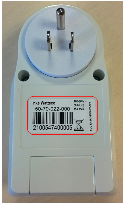
FIGURE 2 - FCC LABEL LOCATION

This label is put on the front of the device, on the casing as it can be seen on the illustration here below. The label is laminated and permanently attached to the casing.