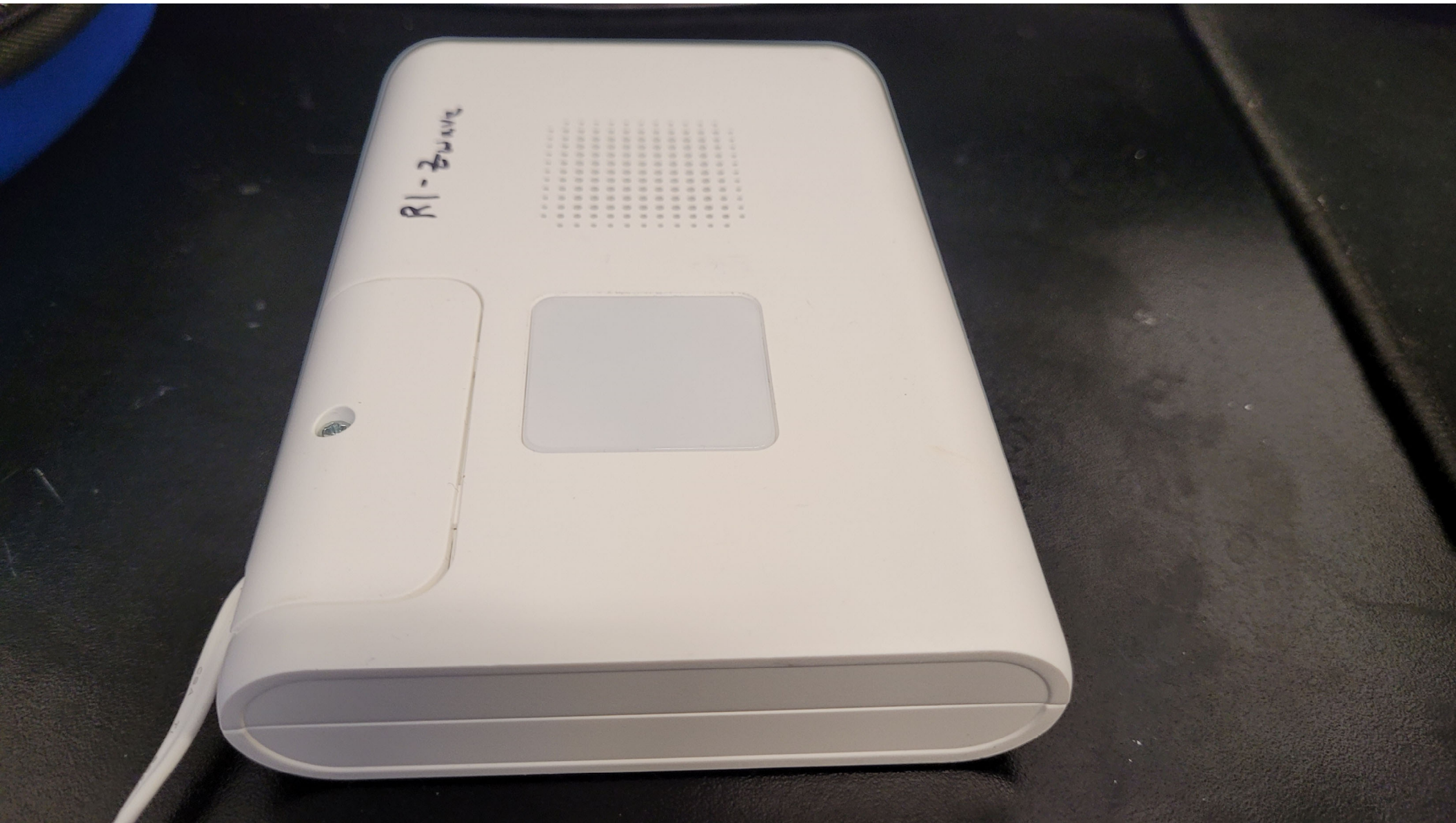
Side View of the EUT #1