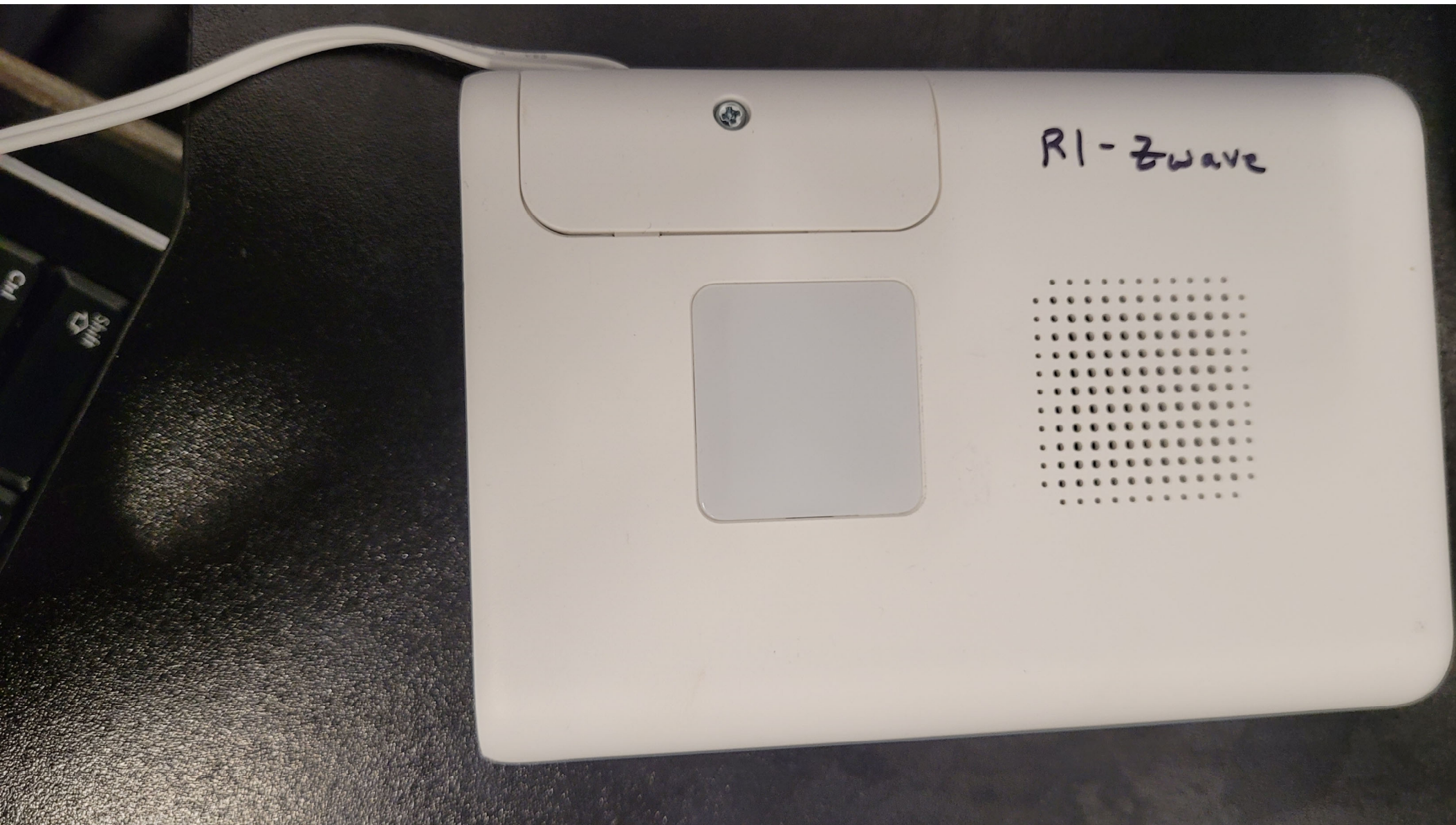
Top View of the EUT