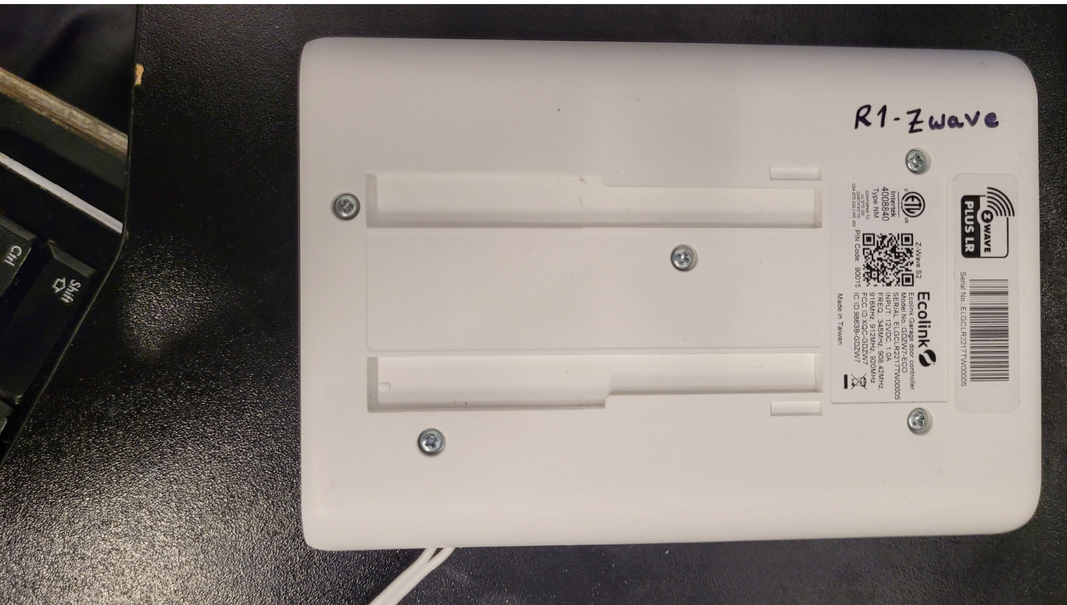
Back View of the EUT