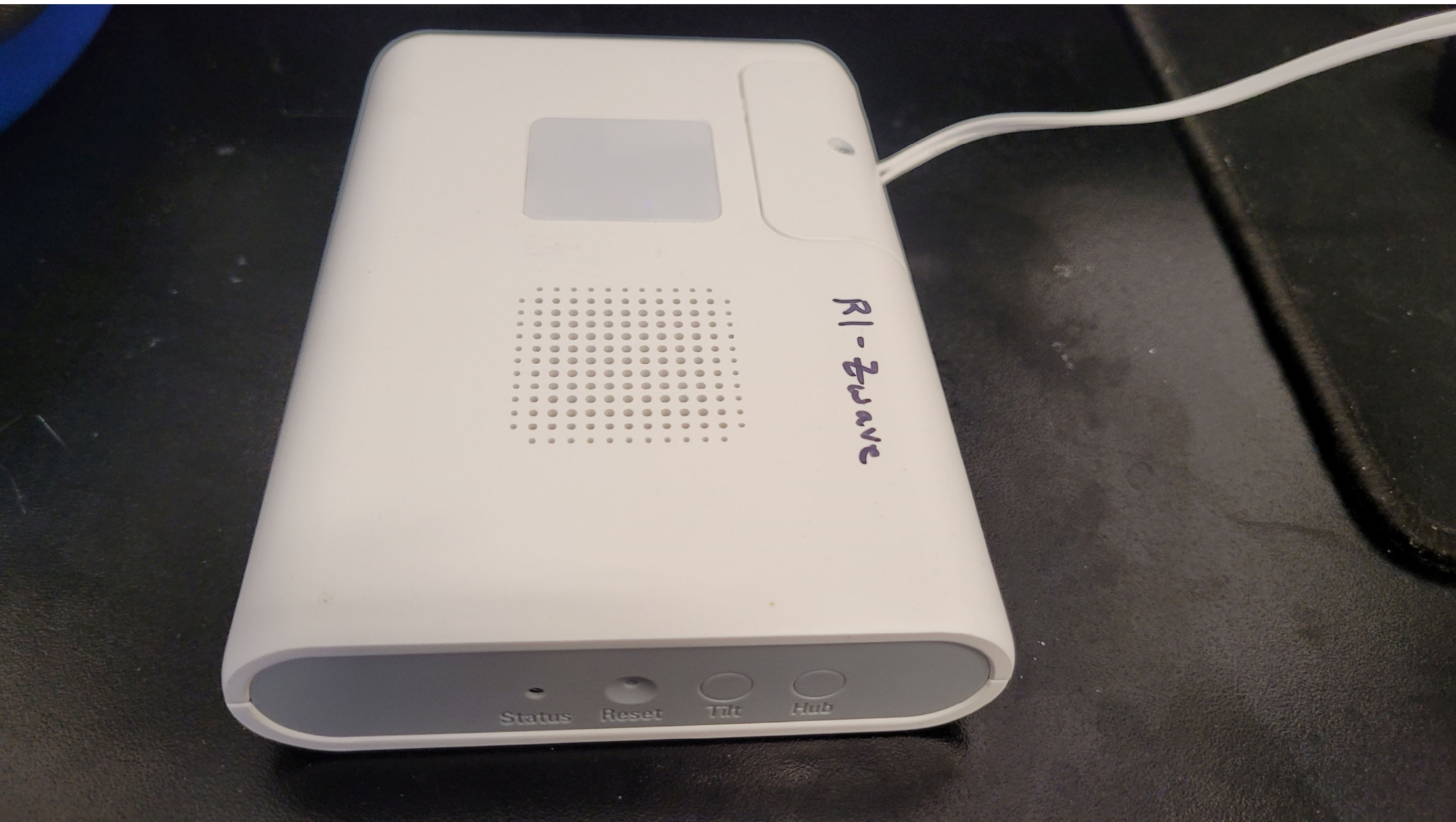
Side View of the EUT #4