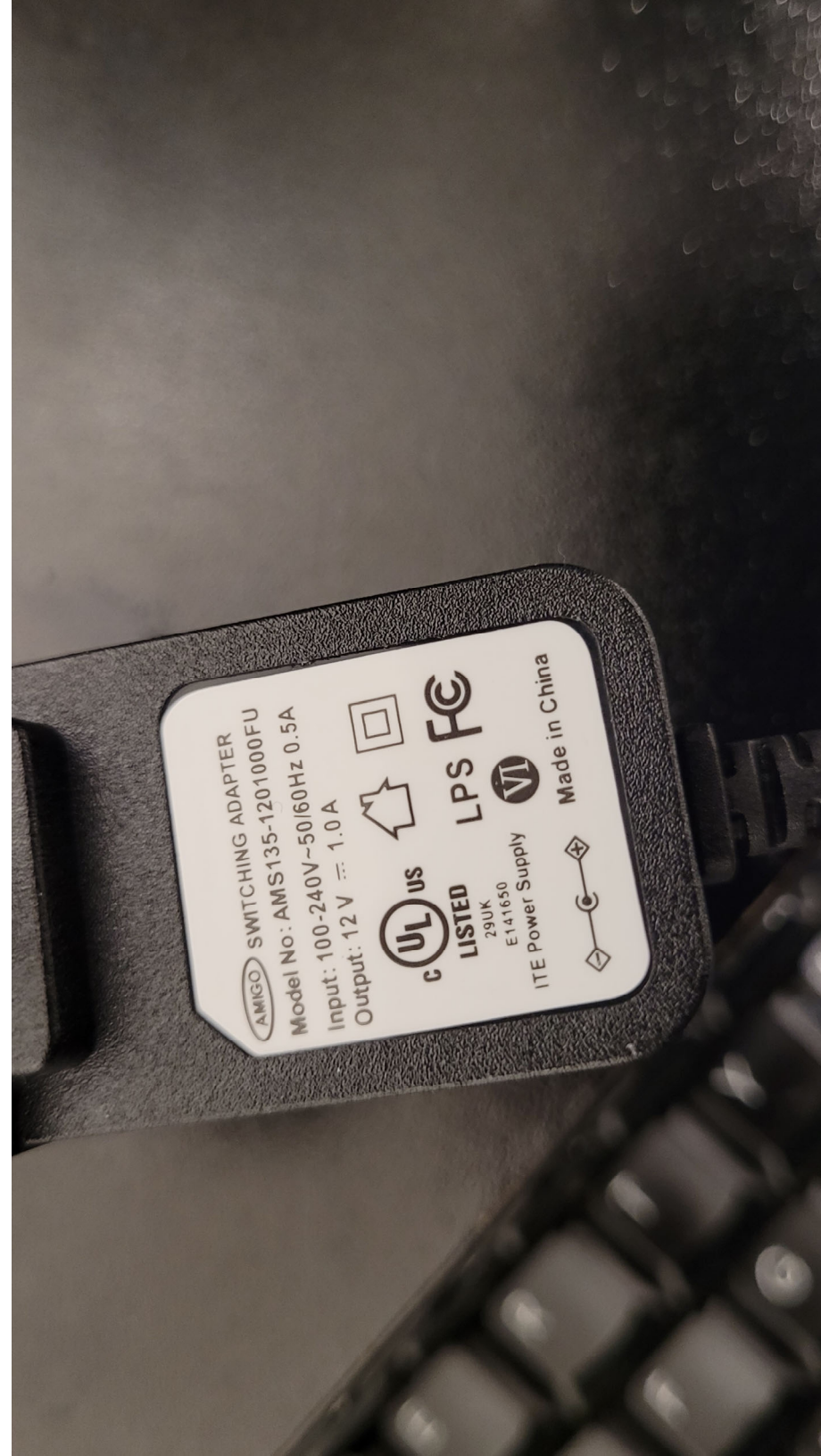
View of the Power Supply - #1