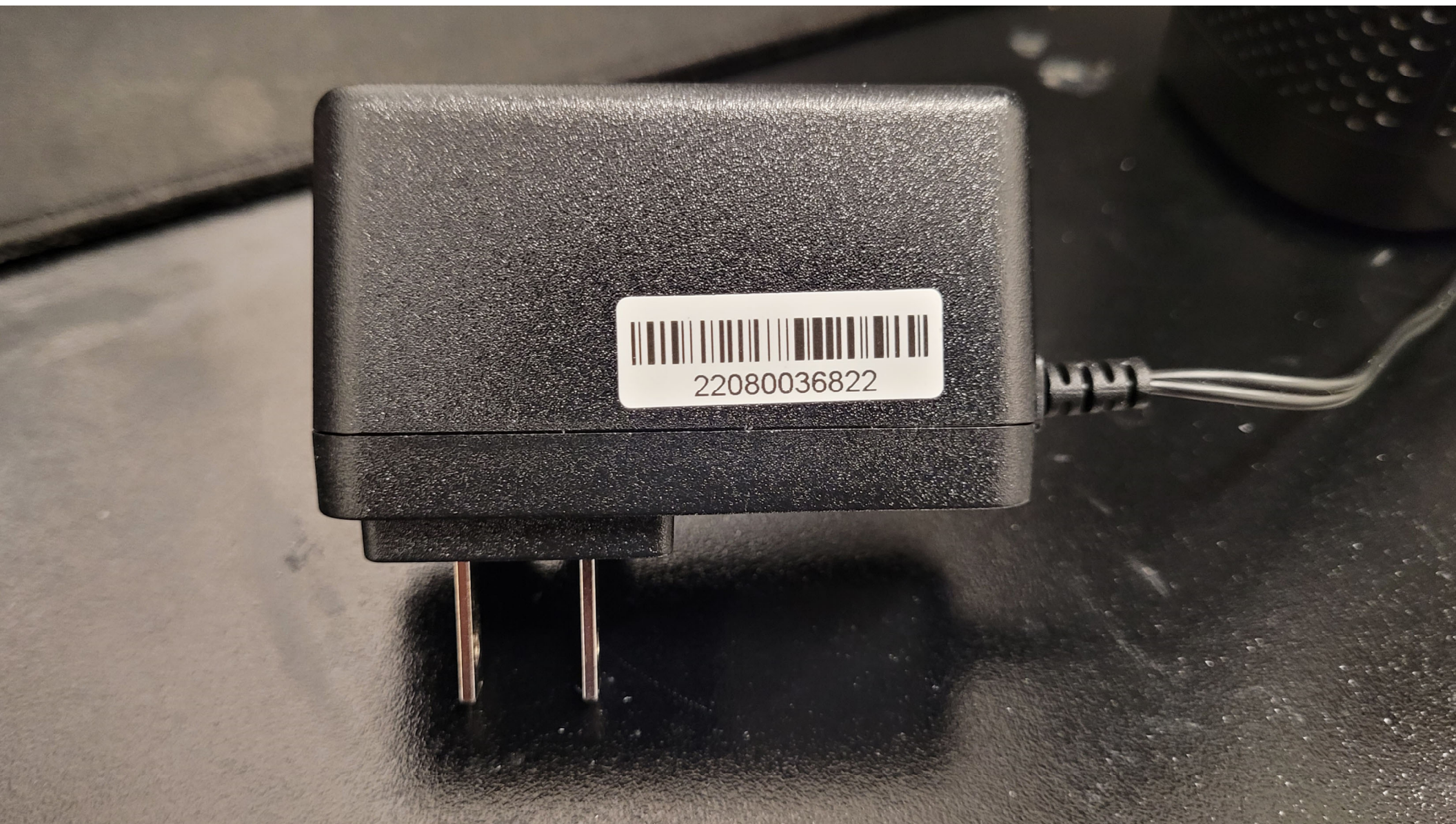
View of the Power Supply - #2