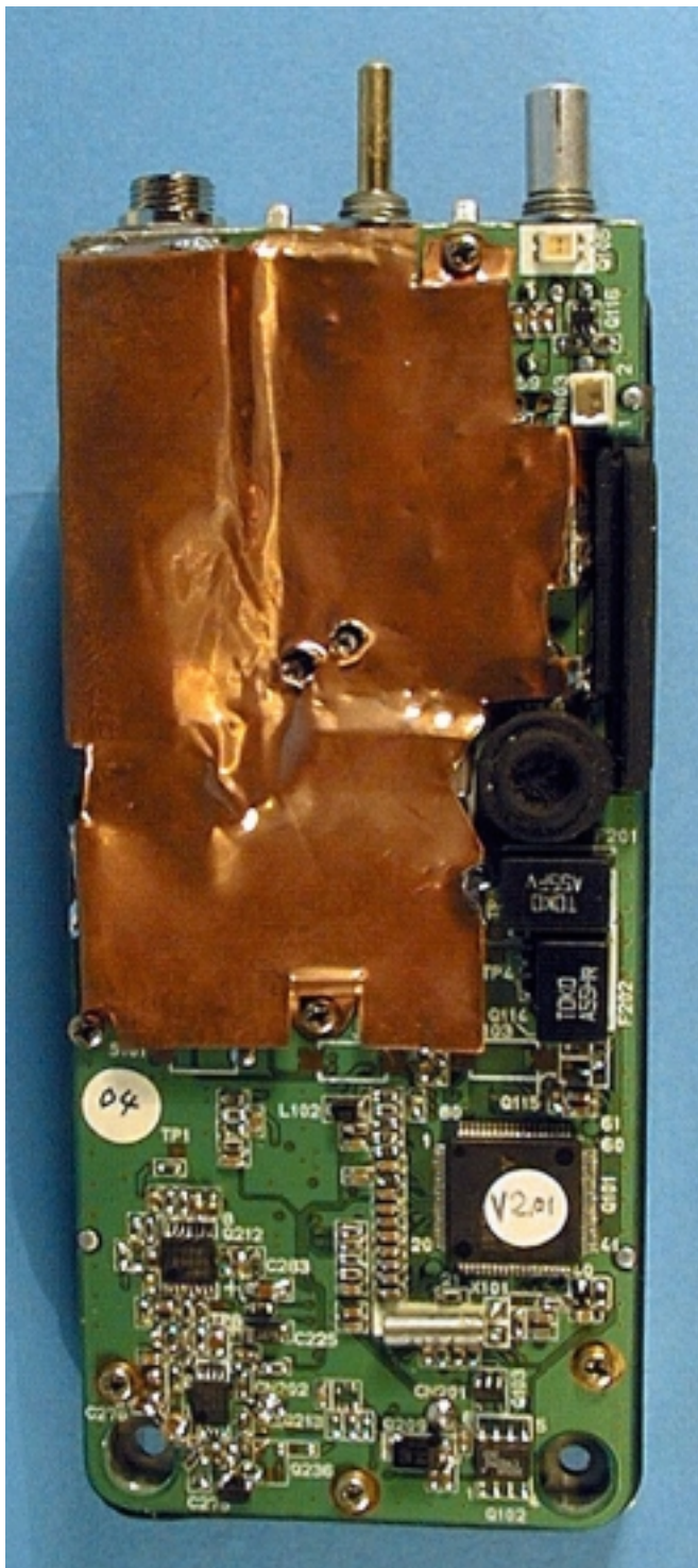
Main Board Top w/Shield