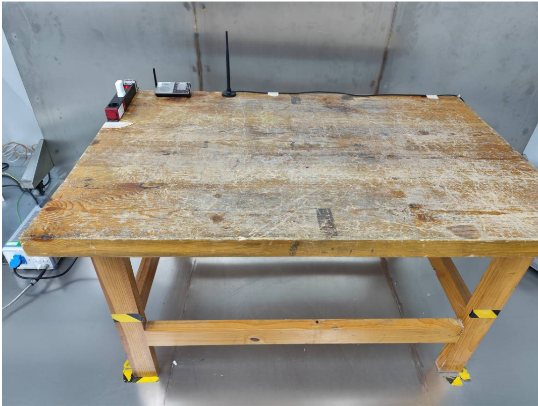
Conducted Emissions Side View-Adapter A318-050100W-US2