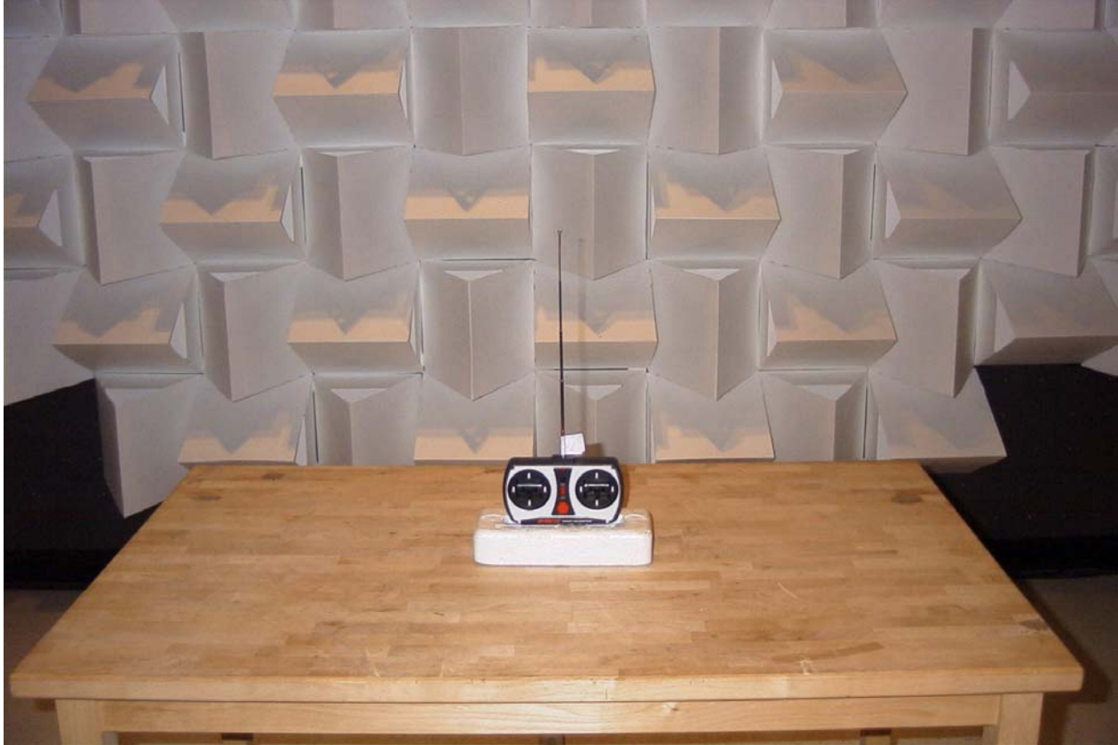
TEST SET UP PICTURE

888.472.2424 F 352.472.2030 email: tei@timcoengr.com