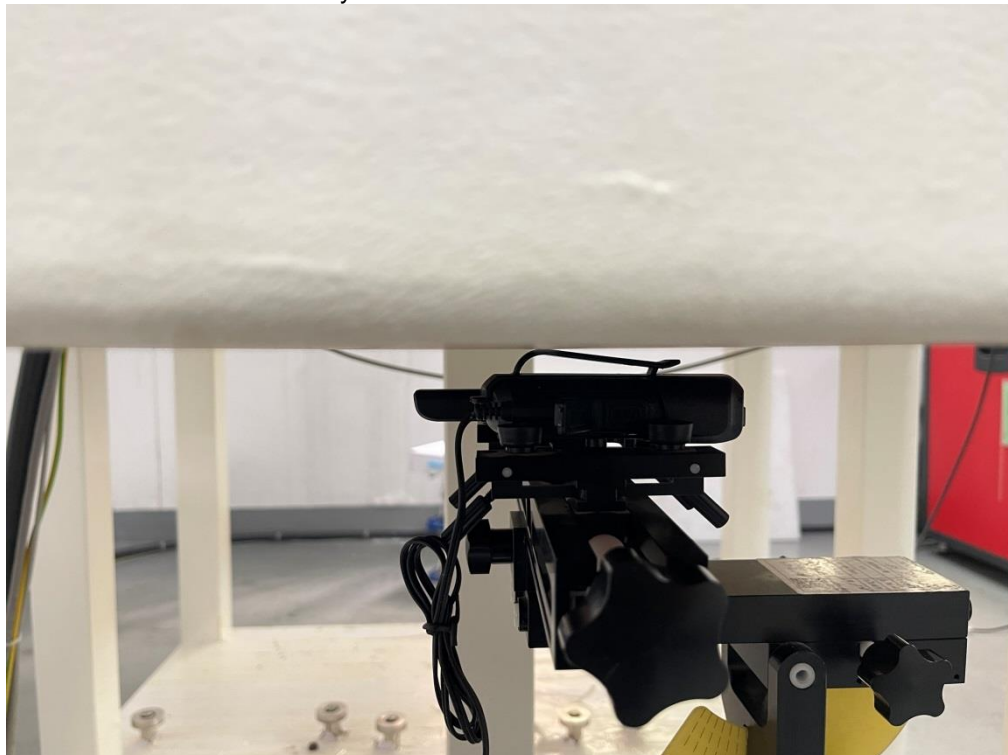
The thickness of EUT is 1.2 cm

Any report having not been signed by authorized approver, or having been altered without authorization, or having not been stamped by the "Dedicated Testing/Inspection Stamp" is deemed to be invalid. Copying or excerpting portion of, or altering the content of the report is not permitted without the written authorization of AGC. The test results presented in the report apply only to the tested sample. Any objections to report issued by AGC should be submitted to AGC within 15days after the issuance of the test report. Further enquiry of validity or verification of the test report should be addressed to AGC by agc01@agccert.com .