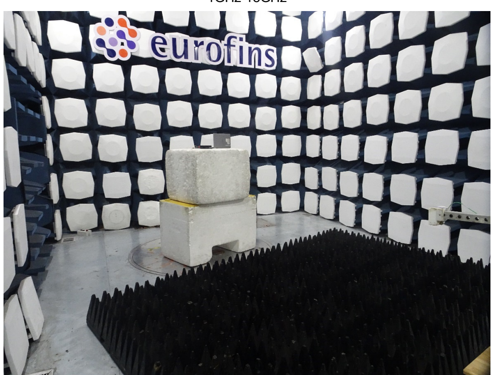
18GHz - 26.5GHz