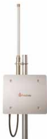
Firetide HotPort/PS Outdoor Mesh Node

Access points can optionally be deployed, indoors or outdoors, to provide first responders and other public safety officials with commercial Wi-Fi communications. Because the mesh is a multi-point-to-multipoint network, and not point-to-point, FCC restrictions on permanent installations do not apply. This same characteristic also allows a HotPort/PS mesh to overcome the many line-of-sight obstructions that cause problems with other wireless technologies.