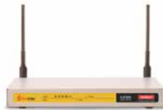
Firetide HotPort/PS Indoor Mesh Node

A jurisdictional HotPort/PS mesh network can provide broadband communications for both intra-agency and interoperable multi-agency needs, including mutual aid. Any organization authorized for 4.9 GHz—local/state police, SWAT, National Guard, fire, EMS, hospitals, FEMA, mass transit, utilities and others—can utilize the license granted to the jurisdiction. HotPort 3100/PS series indoor nodes, which operate seamlessly with HotPort 3200/PS outdoor nodes, can be used to extend the jurisdictional mesh into command centers, city halls and other facilities on a temporary or permanent basis.