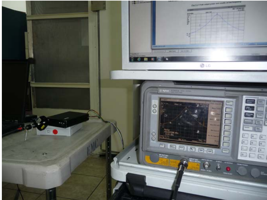
Photograph No.1 Setup for peak output power measurements