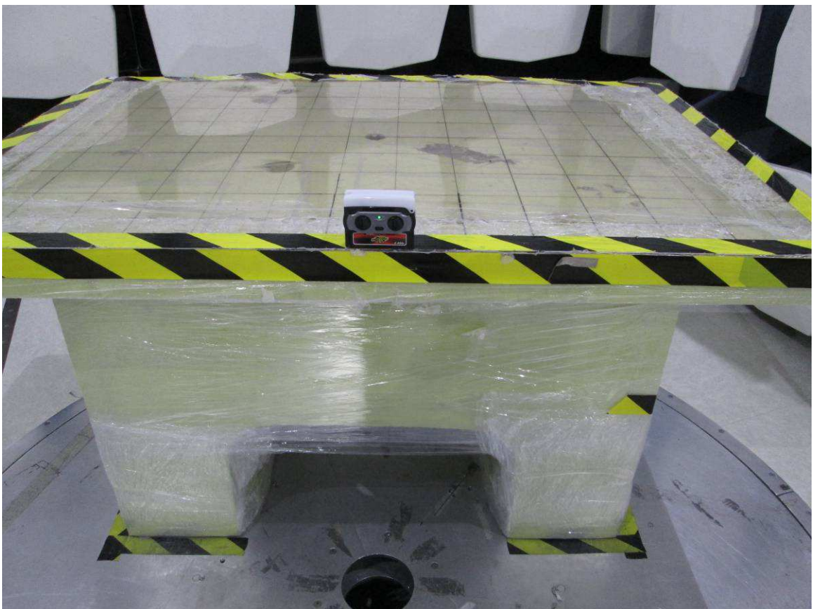
Up to 1GHz (The EuT placed at the center of the turntable)