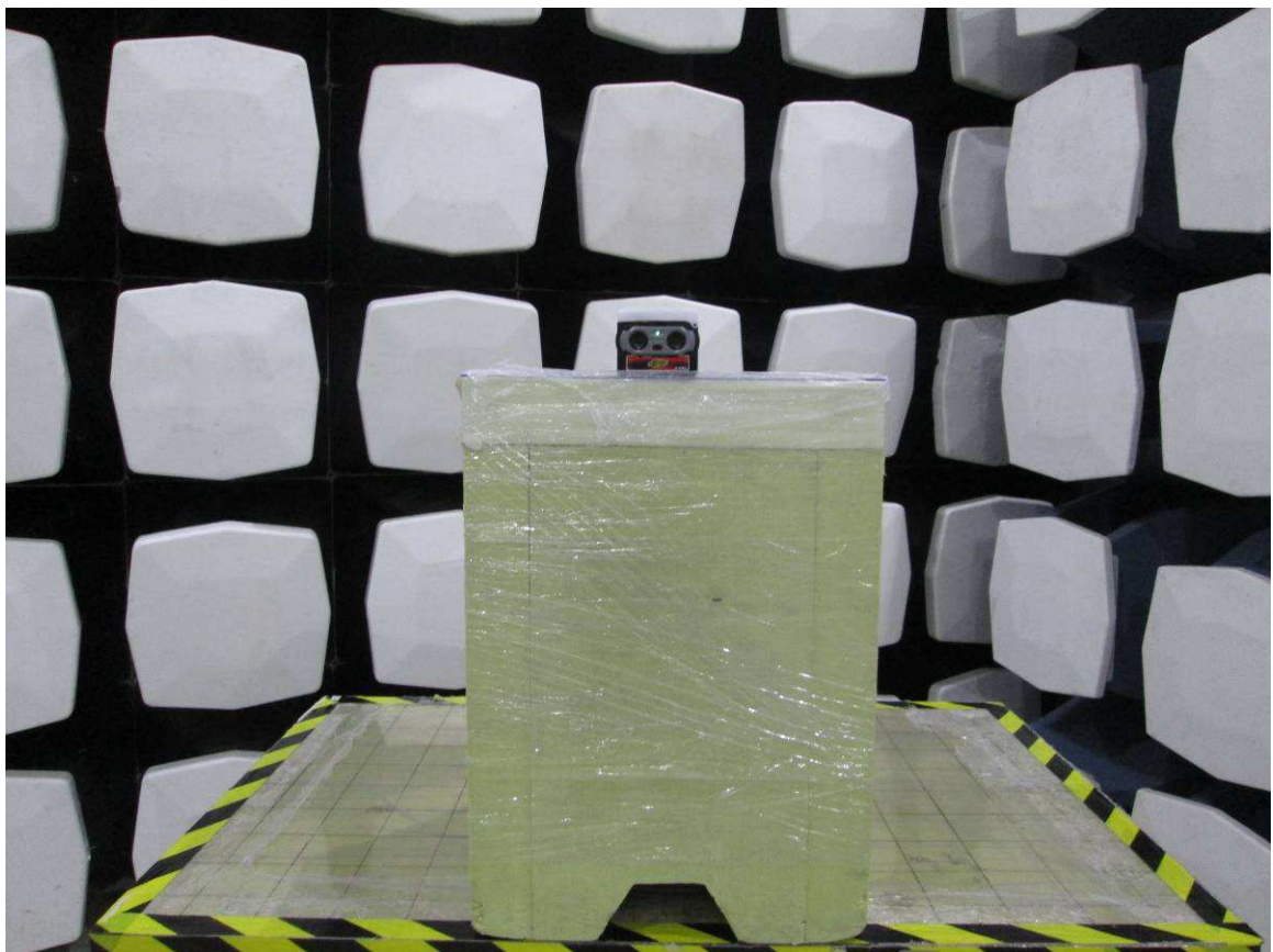
Above 1GHz (The EuT placed at the center of the turntable)