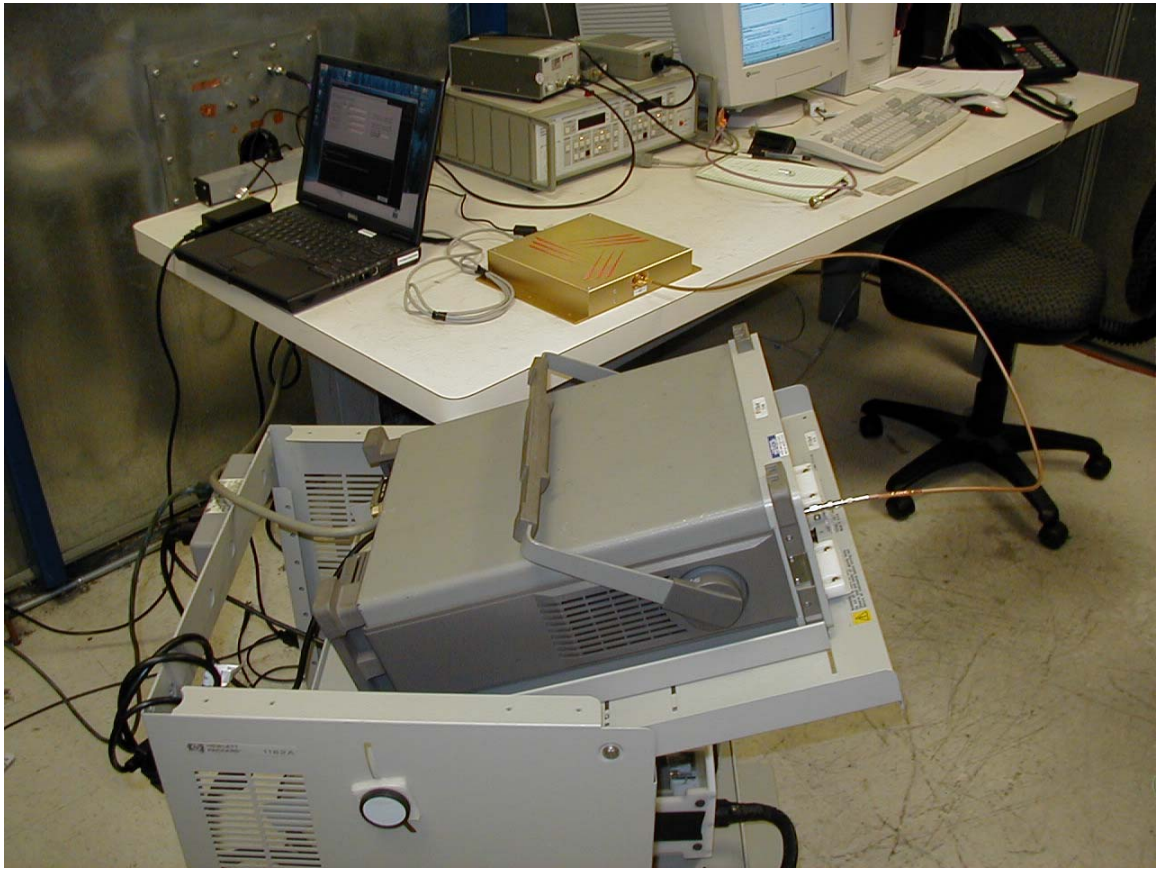
ANTENNA CONDUCTED EMISSIONS TEST SETUP