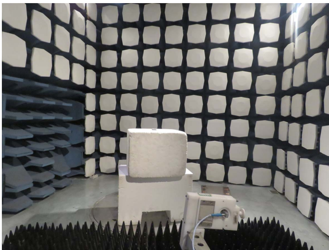
18GHz - 26.5GHz