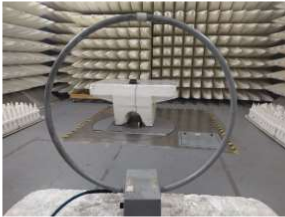
Photograph No.1 Setup for spurious field strength measurements in anechoic chamber from 9 kHz to 30 MHz