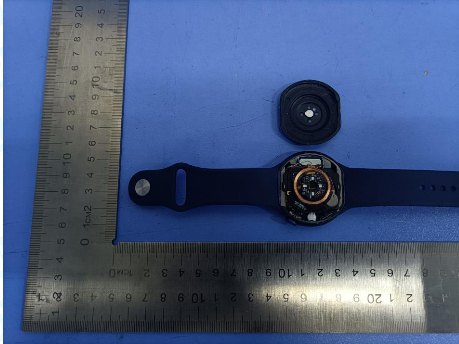
Photo 6 Internal of EUT