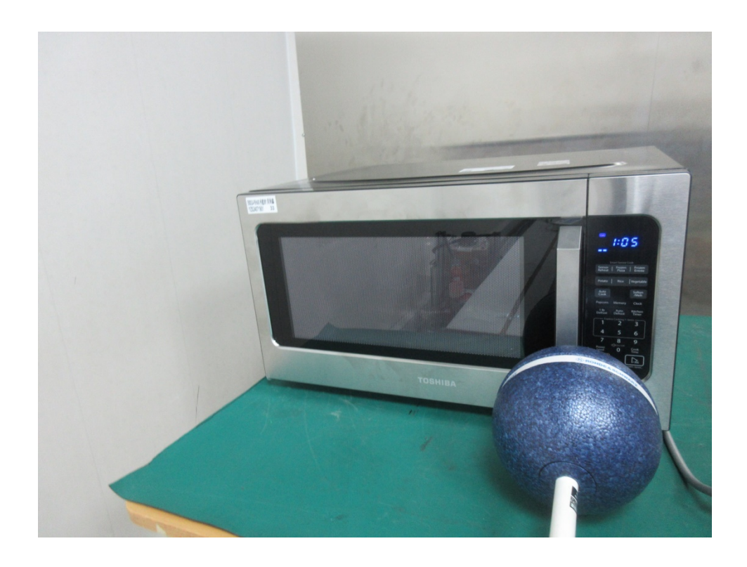
End of the report