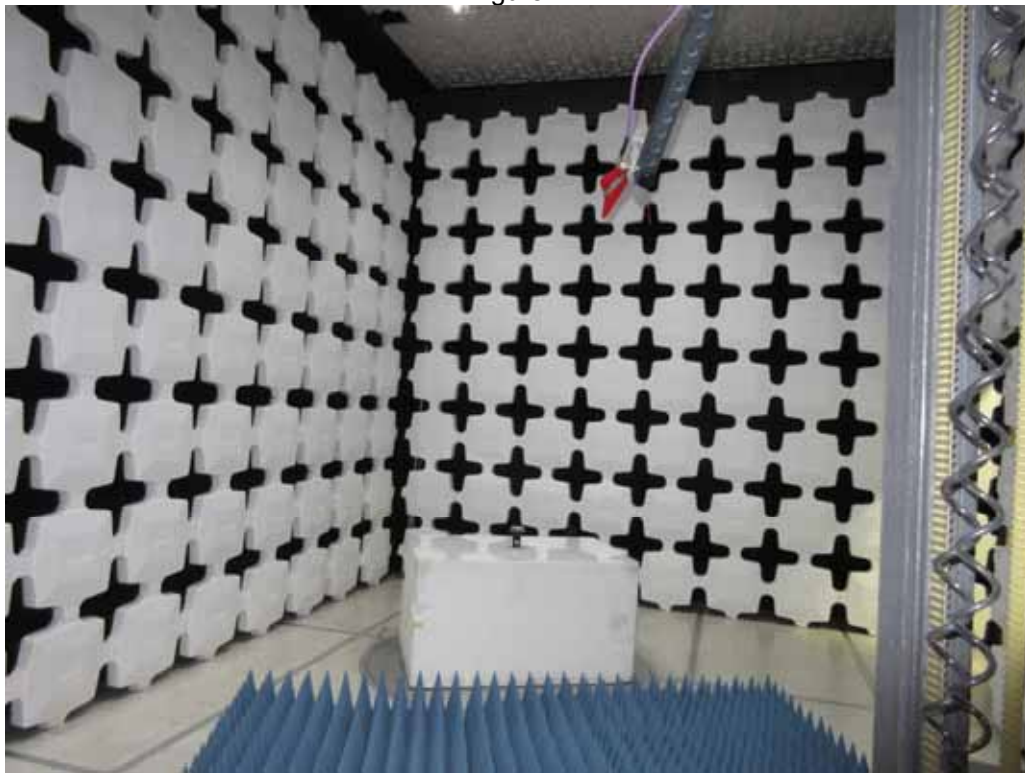
Test Setup for Radiated Emissions – 1GHz to 10GHz, Horizontal Polarization