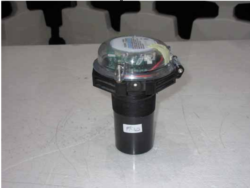
Photograph of the EUT