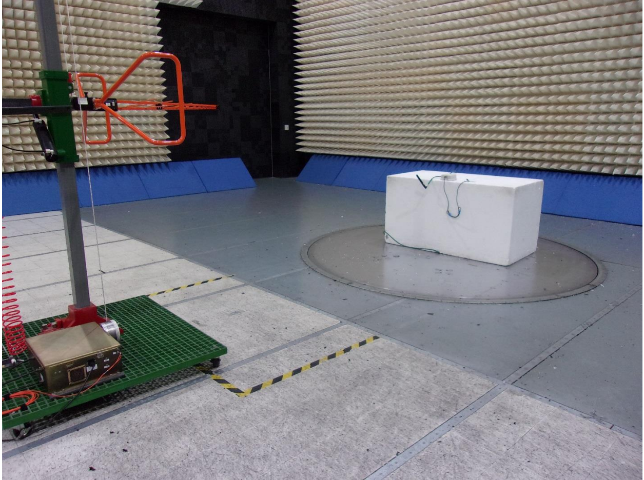
Radiated Emissions (below 1GHz)