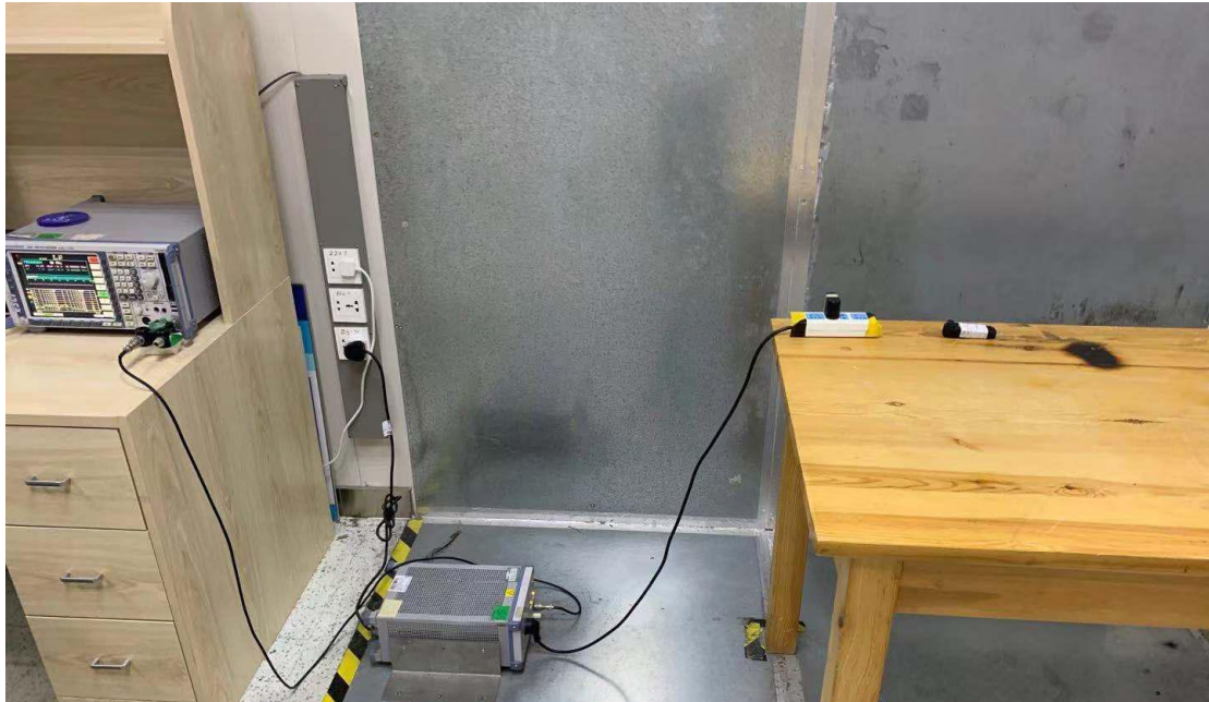
Radiated Spurious Emissions From 30MHz-1000MHz