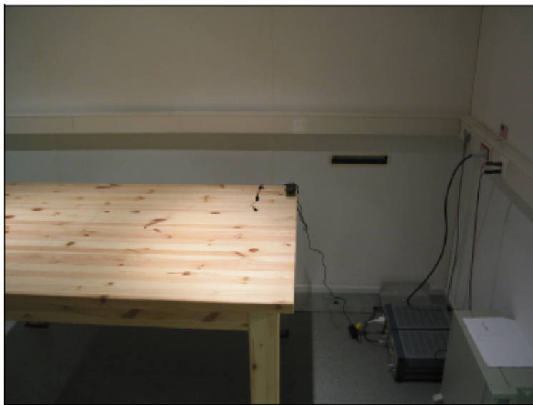
Picture 3 AC conducted emission measurement setup.