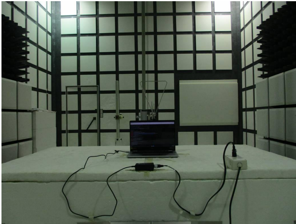
Conducted Setup Photo (Measurement at Antenna Port)