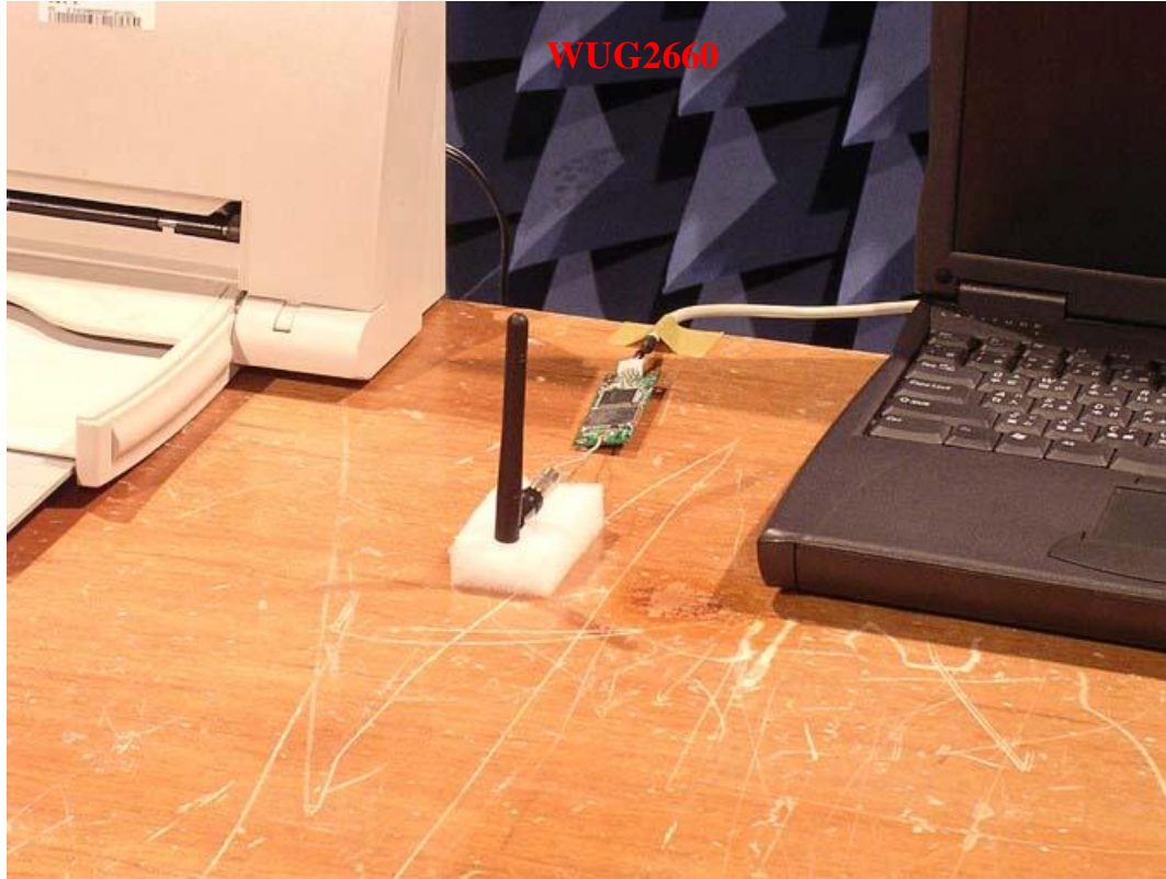
EUT with antenna 1