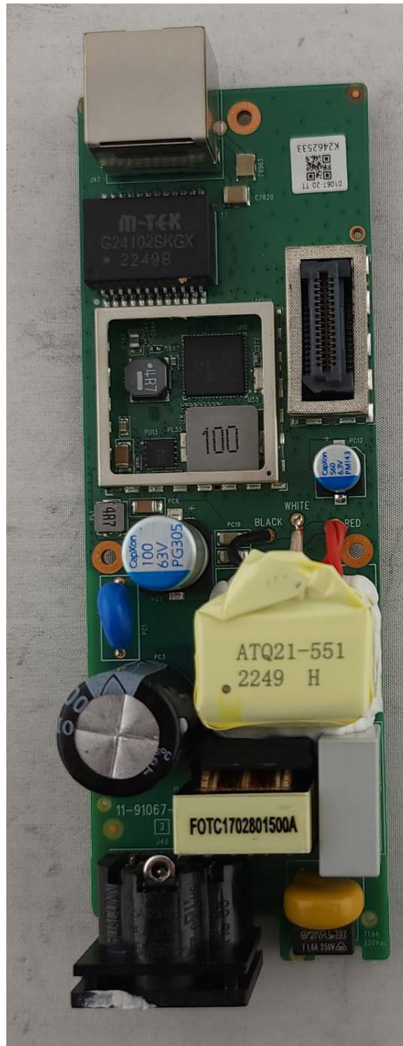
Photograph 4: Top View of PoE/Power PCB with Can Off