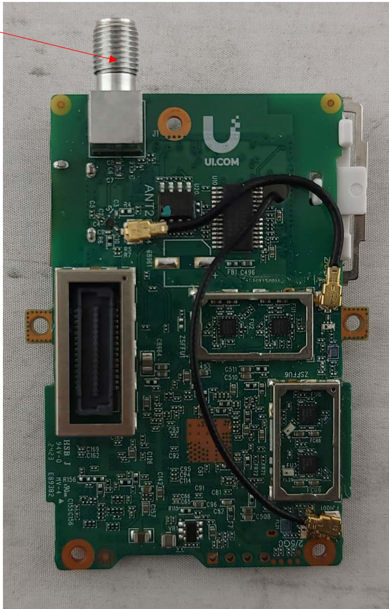
Photograph 1: Top Side Of RF/Transmitter PCB with Cans Off

2.4 & 5 GHz External Antenna only used in External/Internal Antenna Mode