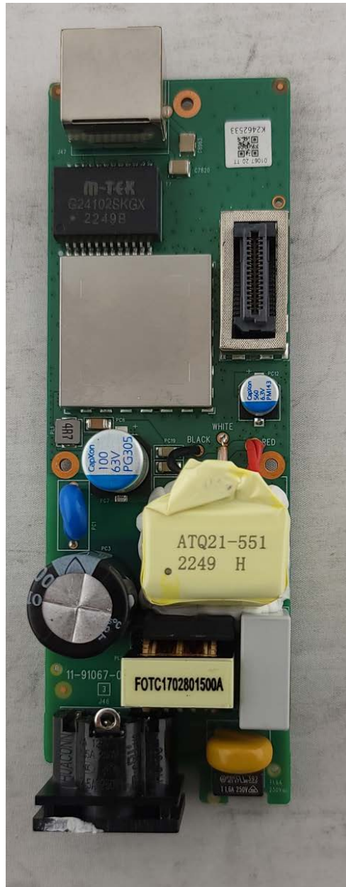
Photograph 3: Top View of PoE/Power PCB with Can On