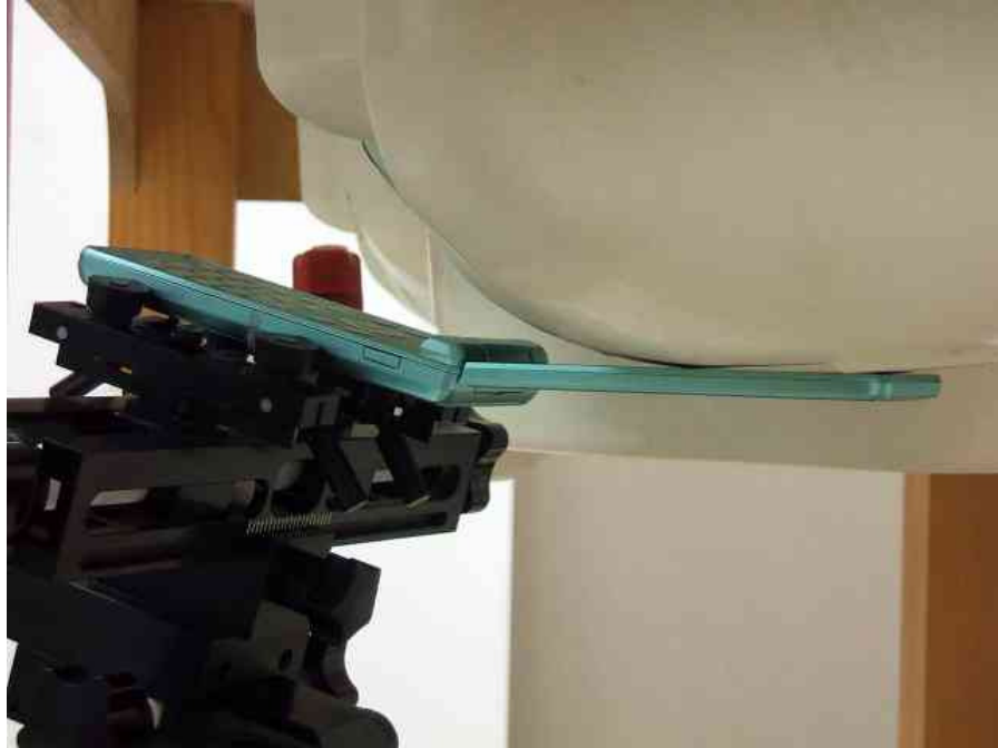
– Cheek-Touch Position –