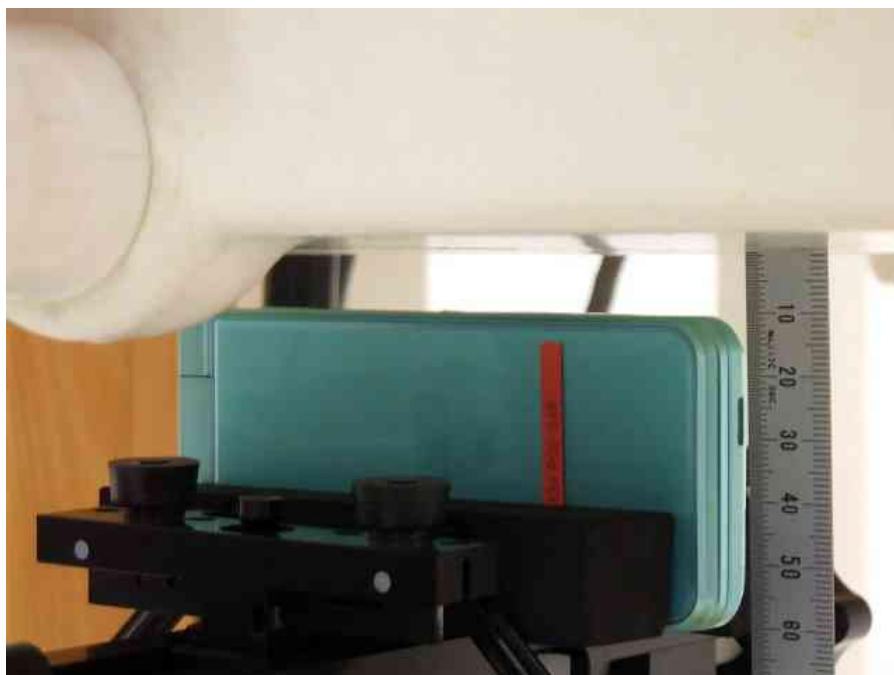
– Edge 2 (Right) –