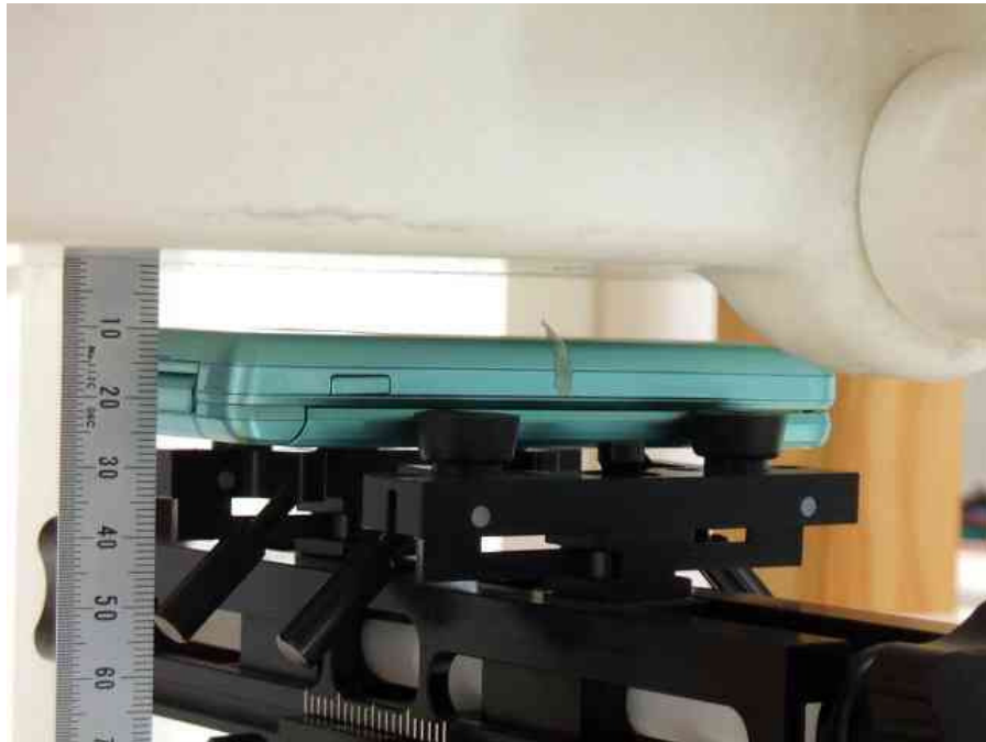
– Rear –