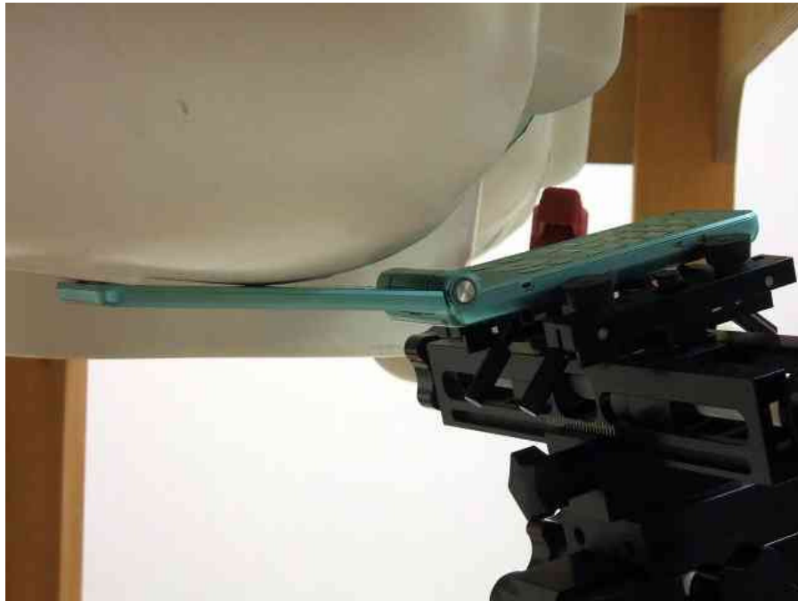
– Cheek-Touch Position –