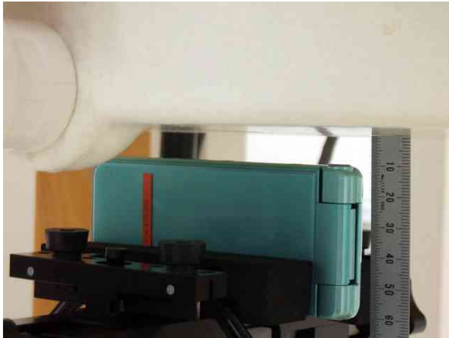
– Edge 4 (Left) –