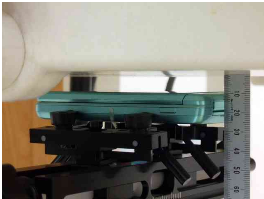
– Front –