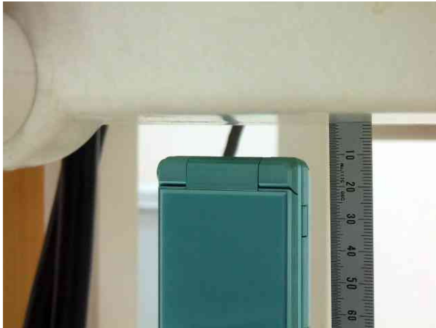
–Edge 1 (Top) –