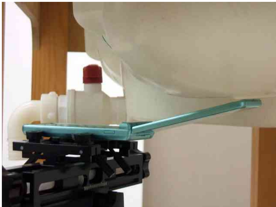
– Ear-Tilt Position –